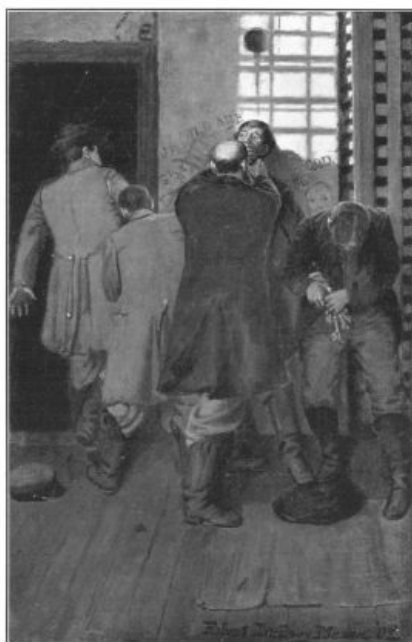
WATSON PLACED HIS HAND OVER THE MAN'S MOUTH

It was a terrible moment. George felt as if he were living ten years in that one instant.