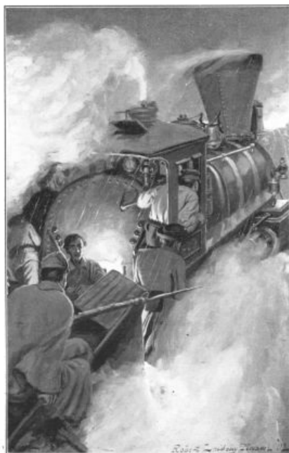
FULLER WAS STEAMING TO THE NORTHWARD WITH "THE YONAH"

When, at last, they did glide up to the station, Fuller learned that the alleged Confederate train bearing powder to General Beauregard had left but a few minutes before. Great was the amazement when he announced that the story of the leader was all a blind, invented to cover up one of the boldest escapades of the war.