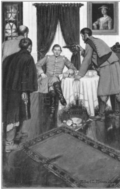
THE MAJOR MERELY CHANGED THE POSITION OF HIS LEGS

The Major suddenly advanced towards George, and patted the tiny animal. "Hello! Waggie, how are you, old man?" he cried. 83