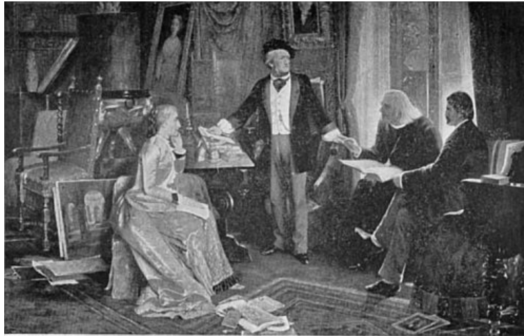
WAGNER AND LISZT

An attempt on the part of the Parliament to meet again was easily frustrated. The taxes were collected as before. When the Parliamentary minority came to order at Brandenburg their sessions were dissolved by royal order. On his own initiative, King Frederick William IV. now proclaimed a constitution. The Chambers, provisions for which were contained in this royal constitution, were to meet at Berlin on February 24, 1849. Such was the end of the People's Parliament in Prussia.