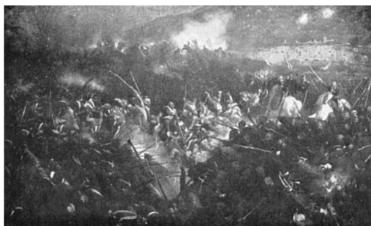
THE BATTLE OF INKERMANN

Painted by Gustave Doré