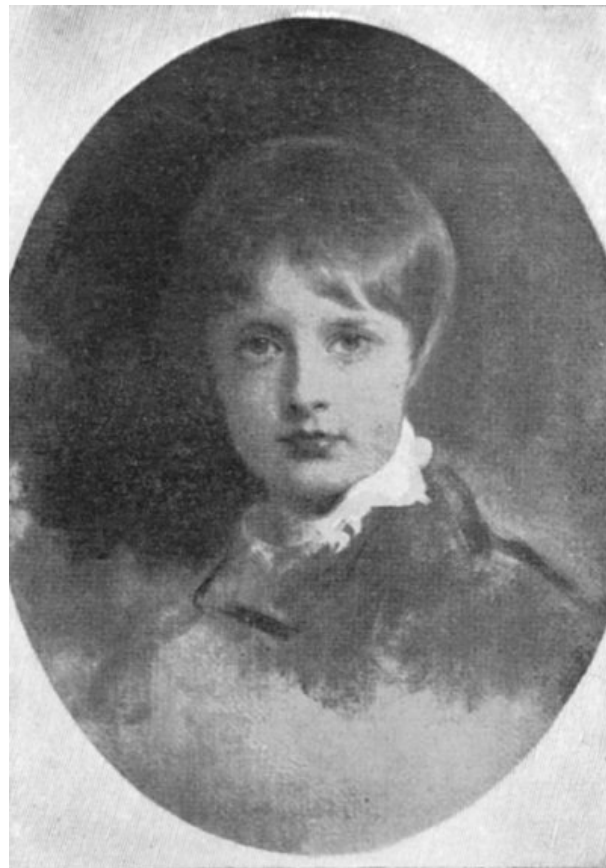
THE KING OF ROME