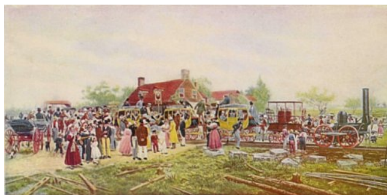
THE FIRST STEAM RAILWAY

The list of years (as links) is for end user ease of use only. The list does not appear in the original, nor (obviously) in the plain text version of this ebook.