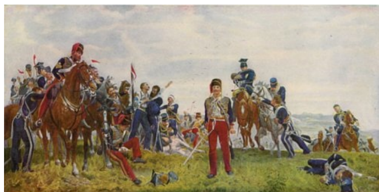
BALAKLAVA—“OUT OF THE MOUTH OF HELL—”

Painted by Elizabeth Thompson (Lady Butler) Copyright. By permission of