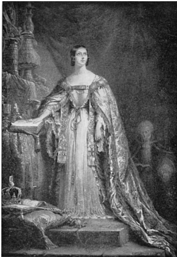
QUEEN VICTORIA TAKING THE OATH