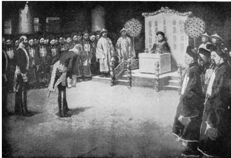
THE EMPEROR OF CHINA RECEIVING THE DIPLOMATIC CORPS

In the meanwhile, Hungary was once more in uproar. Kossuth, after his release from prison in 1840, had become the spokesman of the new generation of Magyars. The other wings of the Hungarian party were led by Szechenyi and Déak.