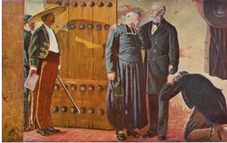
LAST MOMENTS OF MAXIMILIAN