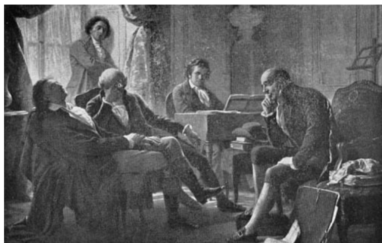
BEETHOVEN AND HIS ADMIRERS