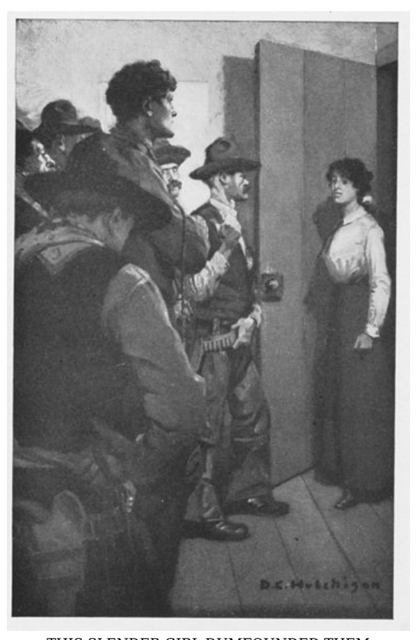
THIS SLENDER GIRL DUMFOUNDED THEM Frontispiece Page 41

*** START OF THE PROJECT GUTENBERG EBOOK CROOKED TRAILS AND STRAIGHT ***