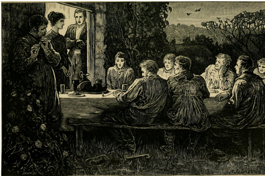
SHE STOOD UP IN THE WINDOW-OPENING, FACING THE MEN.

In addition to the dulcet piping of Gabriel's flute, Boldwood supplied a bass in his customary profound voice, uttering his notes so softly, however, as to abstain entirely from making anything like an ordinary duet of the song; they rather formed a rich unexplored shadow, which threw her tones into relief. The shearers reclined against each other as at suppers in the early ages of the world, and so silent and absorbed were they that her breathing could almost be heard between the bars; and at the end of the ballad, when the last tone loitered on to an inexpressible close, there arose that buzz of pleasure which is the attar of applause.