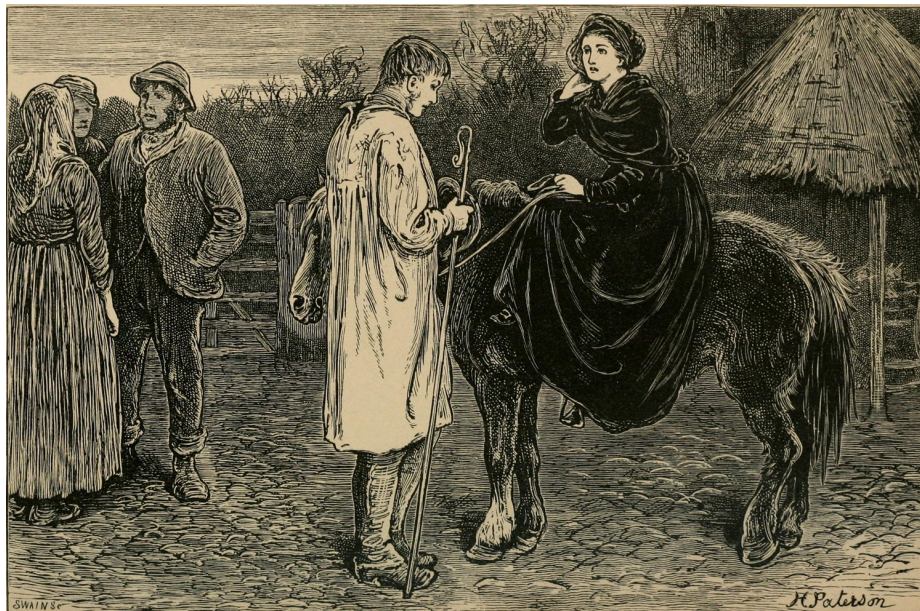
"DO YOU HAPPEN TO WANT A SHEPPERD MA'AM?"