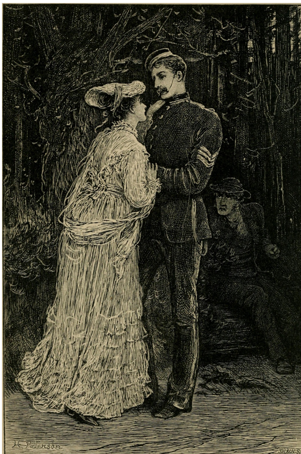
"THERE'S NOT A SOUL IN MY HOUSE BUT ME TO-NIGHT".

all off, so nobody on earth will know of your visit to your lady's bower. Liddy wanted to go to her grandfather's to tell him about her holiday, and I said she might stay with them till to-morrow—when you'll be gone again."