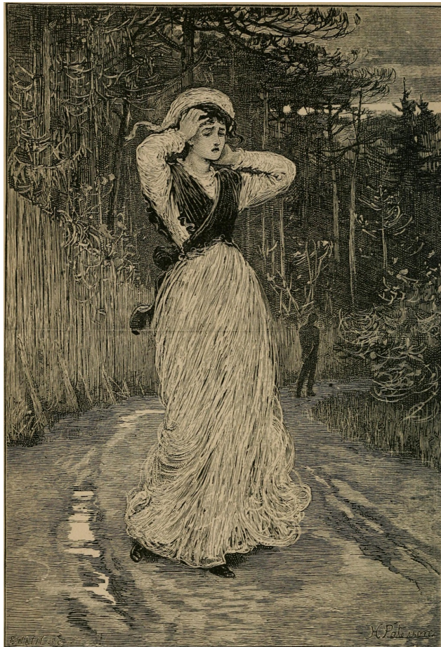
BATSHEBA FLUNG HER HANDS TO HER FACE.

Bathsheba, who had been standing motionless as a model all this latter time, flung her hands to her face, and wildly attempted to ponder on the exhibition which had just passed away. Such astounding wells of fevered feeling in a still man like Mr. Boldwood were incomprehensible, dreadful. Instead of being a man trained to repression he was—what she had seen him.