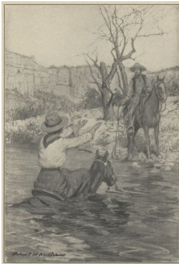
“WON’T YOU PLEASE GET US OUT OF THIS?”

He seemed not in the least excited, continuing to uncoil his rope and recoil it again into larger loops. “Hold your hands over your head!” came his command. 135