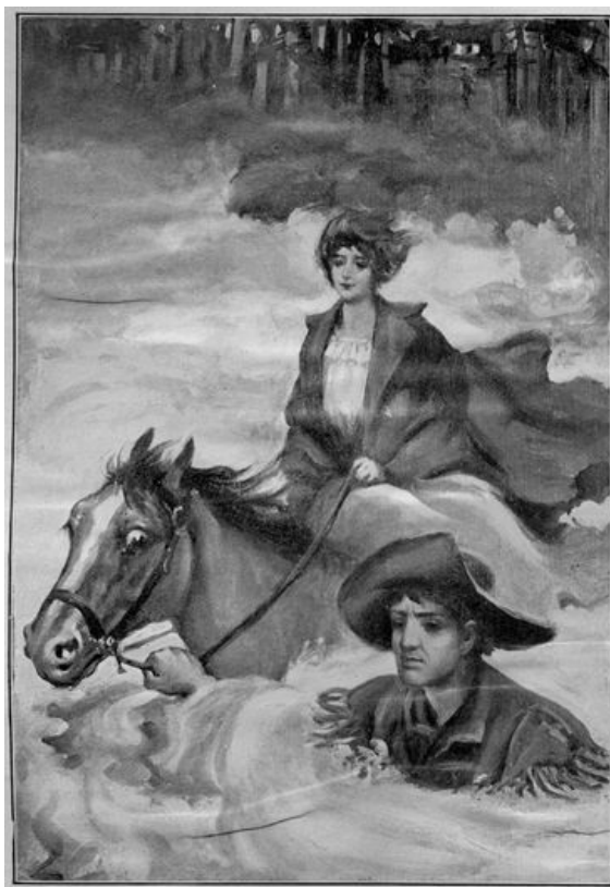
A FIERCE WHITE FROTHING ABOUT HIM.—Page 335.