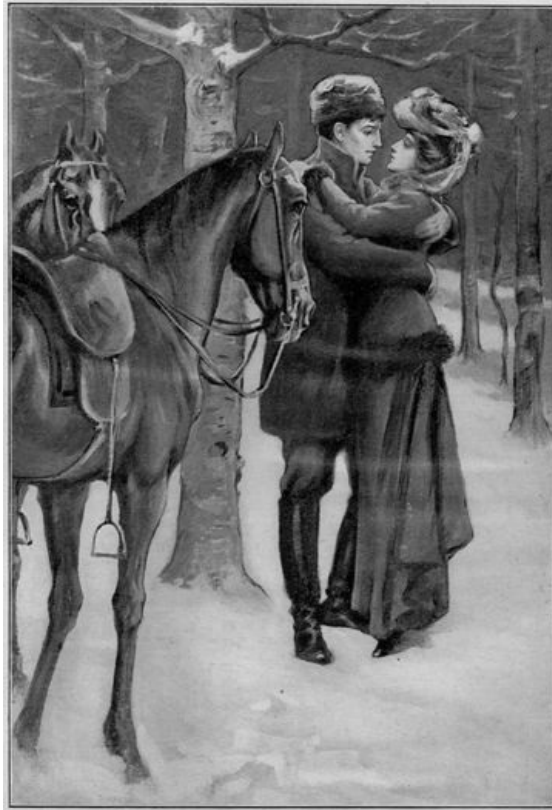
THERE WAS A NOTE IN HER VOICE THAT SET THE MAN'S HEART BEATING FURIOUSLY.—Page 267.

Grant held out his hands. "Then, you must come, my dear. One way or other the struggle will soon be over now, and if I have to go out an outcast I can still shelter you."