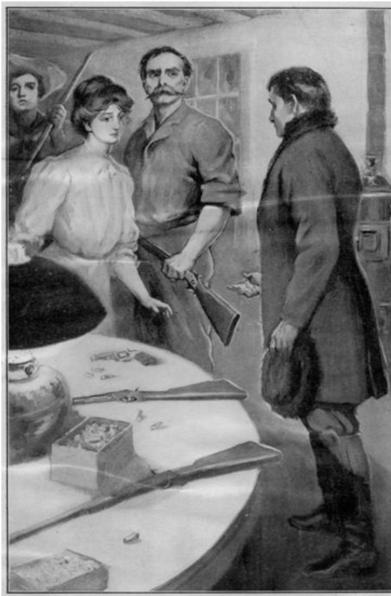
"AREN'T YOU A TRIFLE LATE?"—Page 160.

"No," said Torrance, "we have not. I guess nature knows what's best for him, and I didn't see anything to be gained by rousing him with brandy to start the bleeding." 161