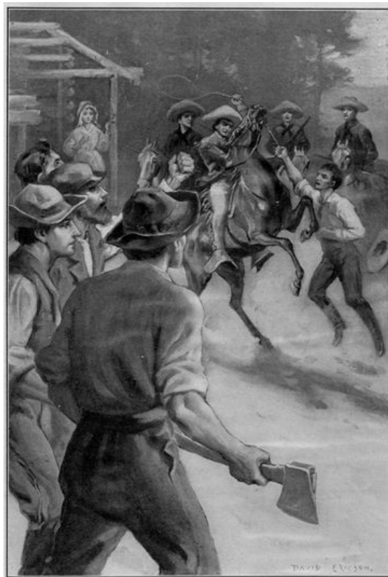
"COME DOWN!"—Page 47.

"Are you going on with the contract? There is the girl to consider," said Grant.