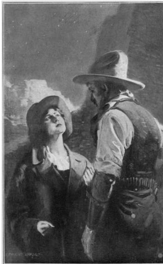
Penny and the Sheriff match wits under the stars.

*** START OF THE PROJECT GUTENBERG EBOOK PENNY OF TOP HILL TRAIL ***