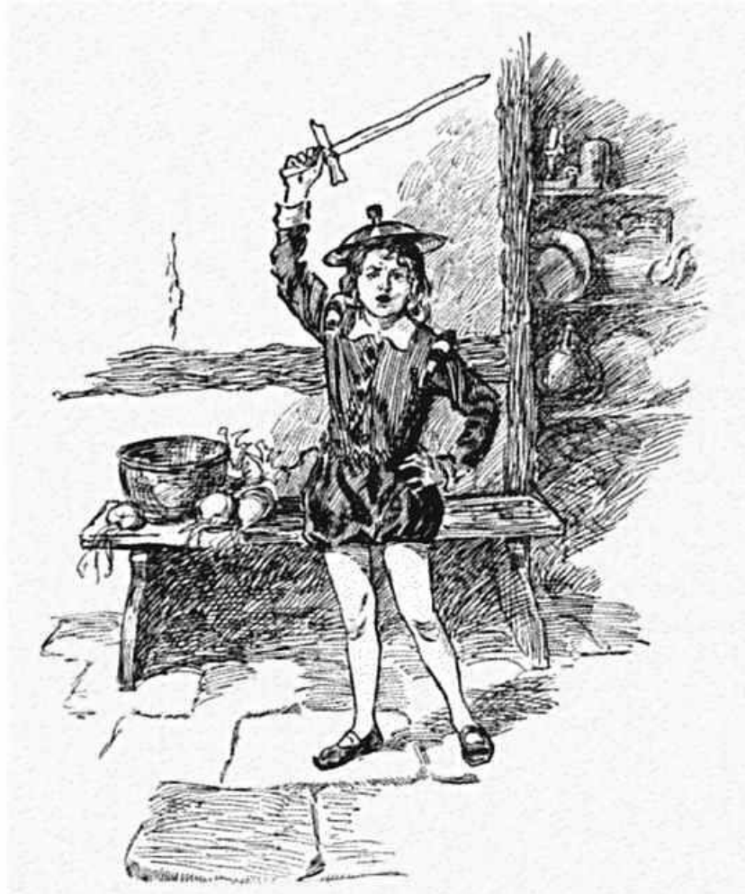
"An' I shall be a player, too' ... says Willy Shakespeare"

And Will, blowing upon his nails aching with the cold, stands squarely with his small legs apart, and looks up at Father. "An' I shall be a player, too, when I'm a man," says Willy Shakespeare. "I shall be a player and wear a dagger like Herod, an' walk about an' draw it—so—" and struts him up and down while his father laughs and claps hand to knee and roars again, until Mistress Shakespeare tells him he it is who spoils the child.