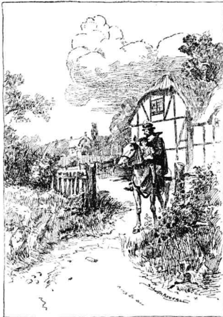
"Bound for Grandfather's at Snitterfield they were"

So the next morning John Shakespeare swung Will up on the horse before him, and the two rode away through the chill mistiness of the dawn, Will kissing his hand back to Mother in the doorway. Bound for Grandfather's at Snitterfield they were. So out through the town, past the scattering homesteads with their gardens and orchards, traveled Robin, the stout gray cob, small Will's chattering voice as high-piped as the bird-calls through the dawn; on into the open country of meadows and cultivated fields, the mists lifting rosy before the coming sun, through lanes with mossy banks, cobwebs spun between the blooming hedgerows heavy with dew, over the hills, past the straggling ash and hawthorn of the dingles. And everywhere the cold, moist scent of dawn, and peep and call of nest-birds. [66]