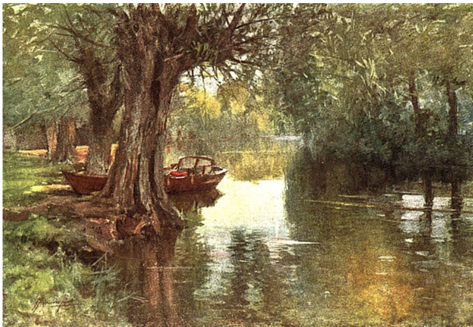
Under the Willows, Cookham-on-Thames

The next is the temperature: how hot or how cold it was—what month in the year? It is unnecessary for Inness to cover his ground with snow to make his picture express a certain degree of cold, neither is it necessary for Monténard to fill his Provençal roads with clouds of dust to show how hot they are. This is done by the opalescent tones of the sky, by the values expressed in reflected lights and in the illuminated shadows, so that you feel in looking across one of Inness's fields of brown grass just how late is the autumn and just how cool it has been, and in looking down one of Monténard's roads you realize how useless would be an overcoat.