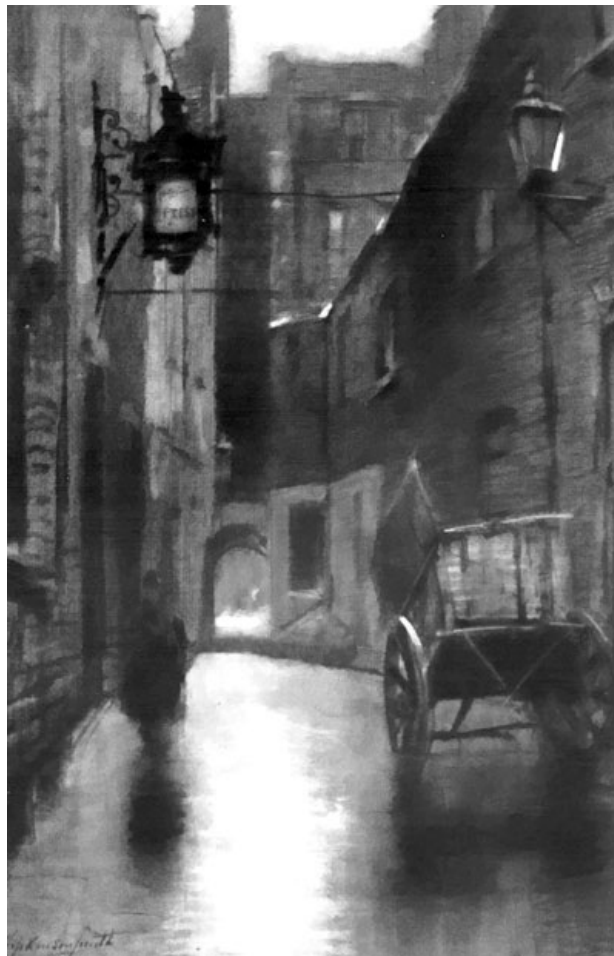
Part of the Site of the Marshalsea Jail, London