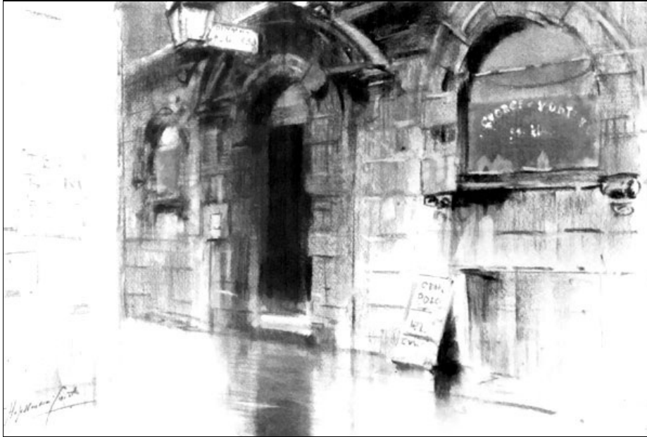
The George and Vulture Inn, London

Now you can "let go," and in the fullest sense, or you will never arrive. My own experience has taught me that if an outdoor charcoal sketch, covering and containing all a man can see—and he should neither record nor explain anything more—is not completely finished in two hours it cannot be finished by the same man in two days or two years. [136]