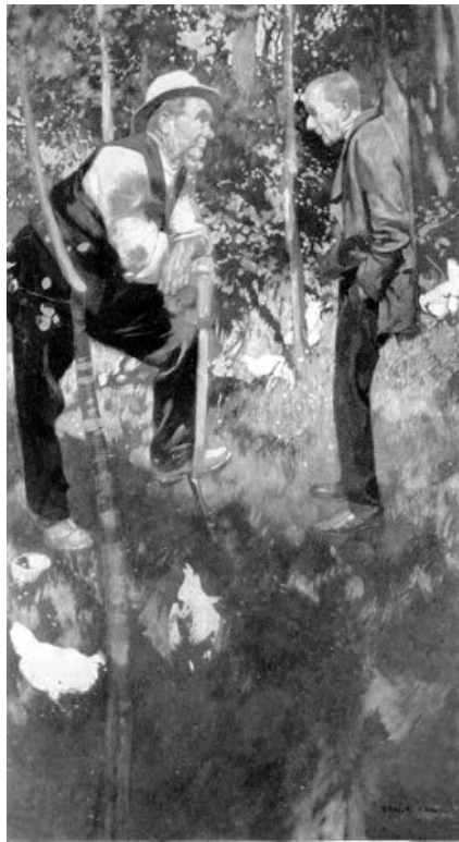
"'Boy?' inquired Ledlie, resting one soil-incrusted boot on his spade."

"Three gals, Pete—that's your record," he remarked, gazing reproachfully out across the salt meadows beyond the causeway. "They won't bring you in nothin'," he added, shutting his thin lips.