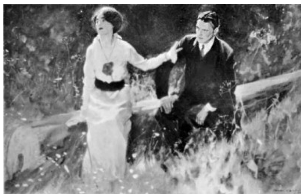
"She suddenly sat upright, resting one slender hand on his shoulder."

"Let it remain unsaid, Clive. A girl must learn one day. But never from the asking. And the same sun shall continue to rise and set, whatever her answer is to be; and the moon, too; and the stars shall remain unchanged—whatever changes us. How still the woods are—as still as dreams."