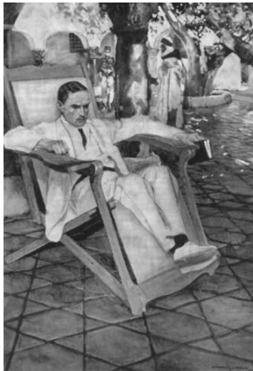
"During convalescence he read 'Under Two Flags' and approved the idea."

That winter Clive got hurt while pig-sticking in Morocco, being but an indifferent spear. During convalescence he read "Under Two Flags," and approved the idea; but when he learned that the Spahi cavalry was not recruiting Americans, and when, a month later, he discovered how much romance did not exist in either the First or Second Foreign Legions, he no longer desired dangers incognito under the tri-colour or under the standard bearing the open hand.