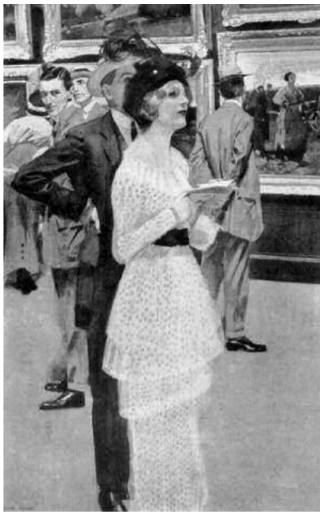
"With him she visited the various museums and art galleries."

"Suppose we dine somewhere?" he suggested, fondling the purring Angora and rubbing its ears.