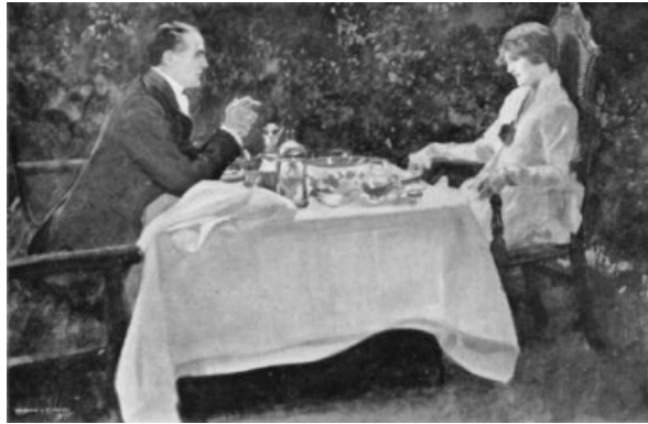
"Sometimes Athalie lunched there in the garden with him."

It was on such a day, at noon-tide, that Athalie bent over toward him, touched his hair with her lips, then whispered something very low.