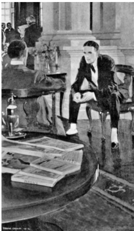
"I like her," repeated Clive, Jr., a trifle annoyed.

"Mother," he said, "you're going about this matter in the wrong way. I am not in love with Athalie Greensleeve. But there is no girl I like better, none perhaps I like quite as well. Let me alone. There's no sentiment between her and me so far. There won't be any—unless you and other people begin to drive us toward each other. I don't want you to do that. Don't interfere. Let us alone. We're having a good time,—a perfectly natural, wholesome, happy time together."