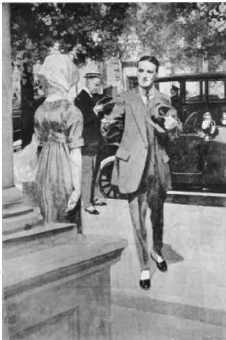
"When he saw her he sprang out and came forward."

Doubtless she understood the complicated code, for she laughed and blushed a trifle and looked around at her maid laden with luggage.