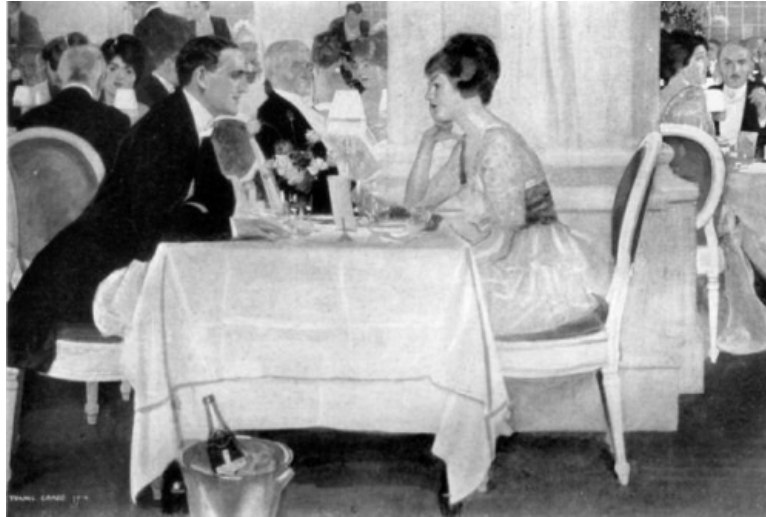
"C. Bailey, Jr. and Athalie Greensleeve ... had supped together more than once at the Regina."

It was pleasure to Clive; but not entirely unmitigated. His father asked him once or twice who the girl was of whom "people" were talking; and when his son said: "She's absolutely all right, father," Bailey, Sr., knew that she was—so far.