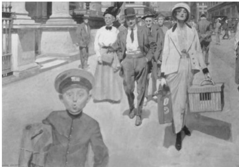
"With a basket containing Hafiz, her suit-case, and a furred umbrella she started for her new lodgings."

And nothing of his would she take with her except the old gun-metal wrist-watch, and Hafiz, and the barred basket in which Hafiz had arrived. Everything else she left, her toilet silver, desk-set, her evening gowns and wraps, gloves, negligées, boudoir caps, slippers, silk stockings, all her bath linen, everything that she herself had not purchased out of her own salary—even the little silver cupid holding aloft his torch, which had been her night-light.