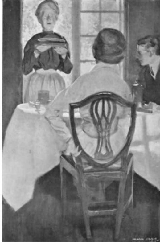
"'Sure I was that worried,' burst out Mrs. Connor."

" You should have told me , dear.... Don't ever fear to tell me what concerns us both. Don't think that leaving me in ignorance of unpleasant facts is any kindness to me. If anything happens to cause you anxiety, I should feel humiliated if you were left to endure it all alone."