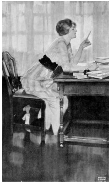
"One lovely morning in May she arose early in order to write to Clive."

He wrote her from the steamer twice, the letters being mailed from Plymouth; then he wrote once from London, once from Paris; later again from Switzerland, where he had found it cooler, he said, than anywhere else during that torrid summer.