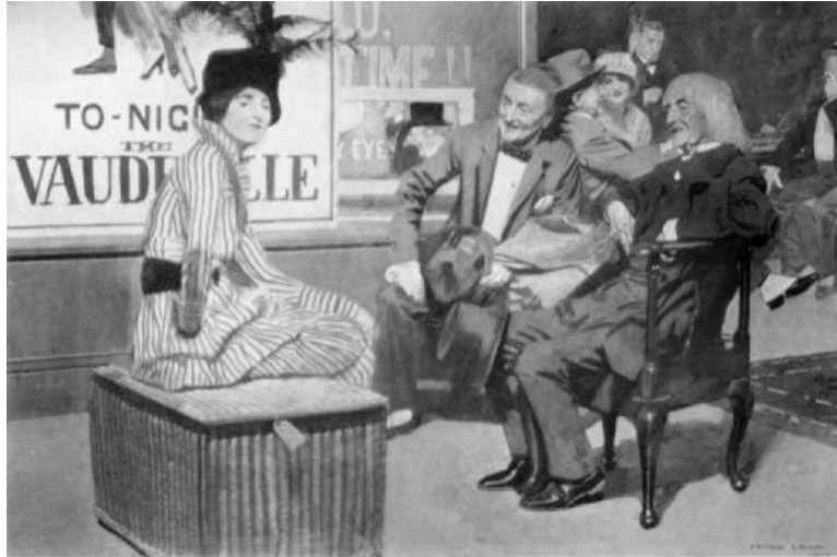
"Doris continued to haunt agencies and theatrical offices."

By July the financial outlook in the Greensleeve family was becoming rather serious: Doris threatened gloomily to go into burlesque; Catharine at first tearful and discouraged, finally grew careless and made few real efforts to find employment. Also she began to go out almost every evening, admitting very frankly that the home larder had become too lean and unattractive to suit her.