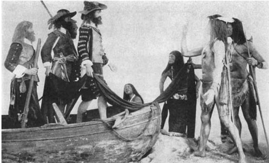
Photo of a group in the U. S. National Museum, Washington, D. C.

In order to conserve their scarce food supply, the colonists sought to acquaint themselves with the use of the native resources. To this end, a number of the settlers were billeted with the Indians. They not only learned to distinguish the edible roots, berries, leafy plants and fruits, and how to prepare them, but found the whereabouts of Indian trails, the location of their villages, and fields where they cultivated corn, beans, and apooke (tobacco).