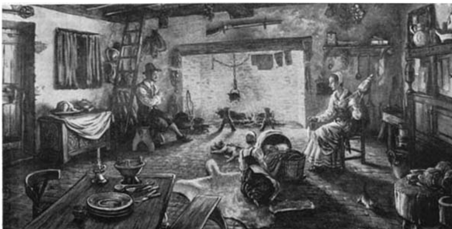
From a painting for Colonial National Historical Park by Sidney King.