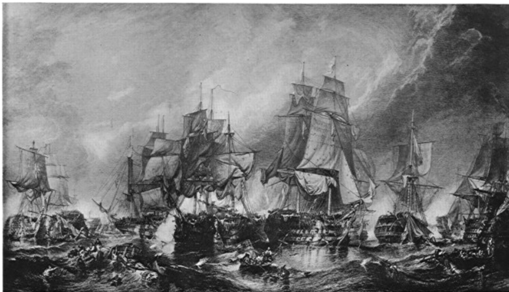
THE BATTLE OF TRAFALGAR. [C. Stansfield, R.A., Pinxit.