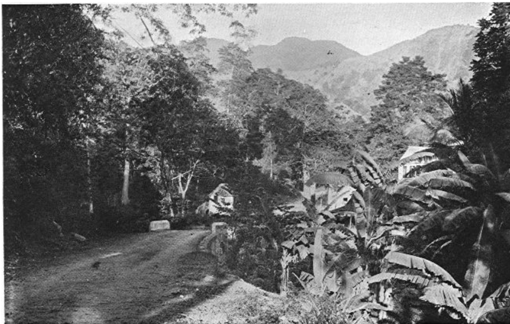
FOREST SCENERY, JAMAICA.