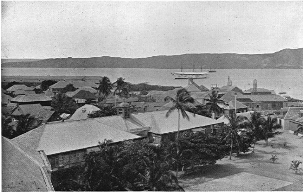
PORT ROYAL, JAMAICA.