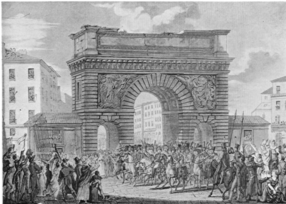
THE ENTRY OF THE ALLIES INTO PARIS BY THE PORTE ST. MARTIN, MARCH 31, 1814.

The mounted National Guard who came after the royal carriage out-Heroded Herod by their deafening cries of loyalty. Who would have imagined these gentlemen would have played the harlequin and receive their dethroned Emperor as they did when he entered Paris again? "Put not your trust in men, particularly Frenchmen in 1814, O ye house of Bourbon, for they made ye march out of France without beat of drum."