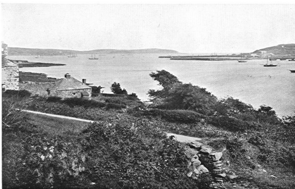
FALMOUTH HARBOUR.