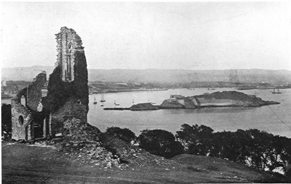
PLYMOUTH HARBOUR.