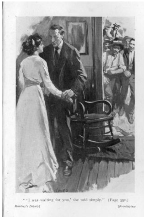
"'I was waiting for you,' she said simply." (Page 352.) Hawtreys Deputy] [Frontispiece

"I was waiting for you," she said simply.