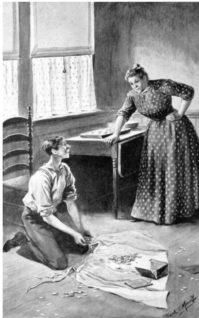
"HE BEGAN TO GATHER UP THE COINS."

But Fayette was not. He had never been so active. He began to gather up the coins which had been scattered by the breaking of the chest and, for want of something better in which to store them, pulled Cleena's apron from her waist and piled them in that. She sat on, silently regarding him. For a few minutes she honestly believed that he was a genuine specimen of the "little people" who were said to make green Erin their favorite home. But when he began to gabble in a hoarse, excited tone of how he had long been expecting this "find"; how he had watched his opportunity when all the household should be absent that he might disobey and use the explosive that would lessen his labor so greatly, she came back to common sense. [Pg 336]