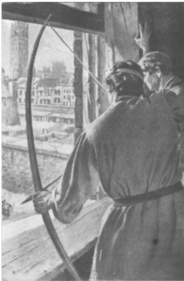
"AN INSTANT LATER THE BOWSTRING TWANGED"

Then he laughed heartily, unaffectedly. "What a comedy! and you and I cast for the fools in it. Which is the bigger one neither of us should be willing to say. And for the best of reasons, we don't know. My compliments, brother imbecile, and so good-day." [Pg 119]