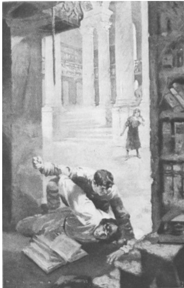
"THE BLOWS RAINED DOWN UPON HIS FACE"

"You know the law about harboring a House-dweller, and since you choose to violate it"—here he shrugged his shoulders detestably—"let Dom Gillian see to it. Yet, for the sake of peace, I will ask you once more to surrender this serf, who bears my mark and is legally proved my property. In the end it may save a mountain of trouble. What say you?"