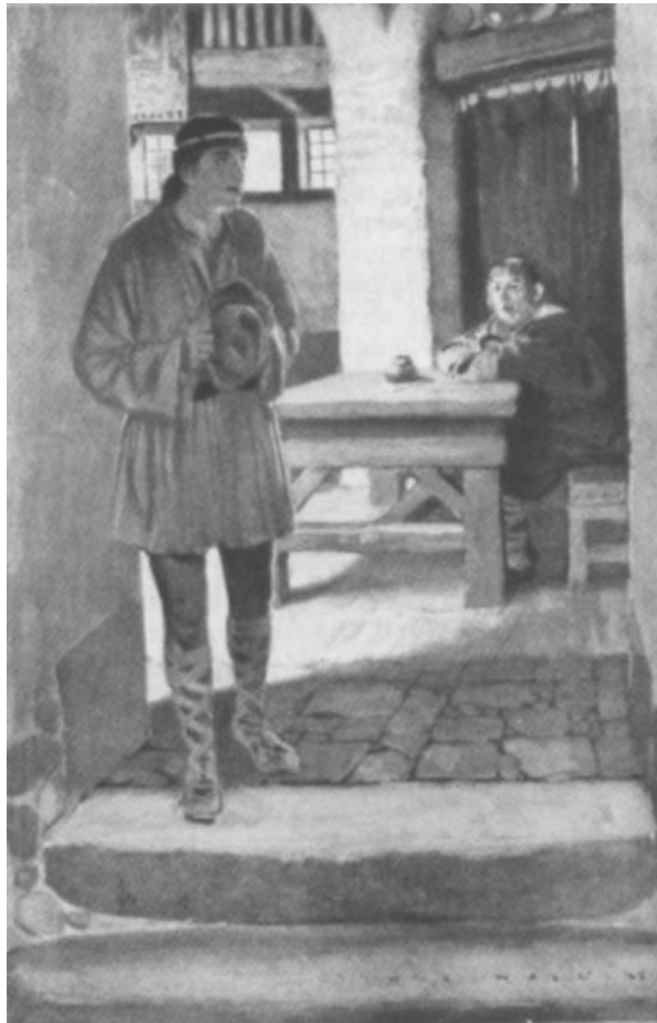
"THEY PARTED WITHOUT FURTHER SPEAKING"

His personal belongings were not burdensome to transfer—the books, half a dozen in all, his revolver and field-glass, and a good ash bow with twelve dozen arrows, each bearing his private mark of a scarlet feather. These last he had been at work upon through many a long evening in the last two months, and he was sure that they would serve him well should need arise. Clothing and blankets he did not trouble about, even with the cold weather close at hand, for he could reckon certainly on finding abundant supplies of this nature in the city itself.