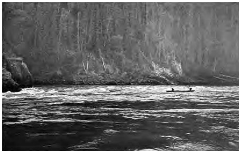
APPROACHING THE GRAND CAÑON ON THE FRASER RIVER

At last they pulled up alongside of a broad and brawling stream, turbulent but shallow, a little threatening to one not skilled in mountain travel, but not dangerous to a party led as was this one, by a man acquainted with the region.