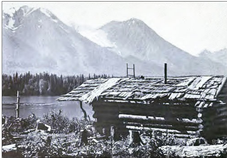
A TRAPPER'S SHACK, STANDING AT THE EDGE OF THE BEAUTIFUL MOUNTAIN LAKE WHICH LAY GREEN AND MIRROR-LIKE, SURROUNDED ON ALL SIDES BY GREAT MOUNTAIN WALLS