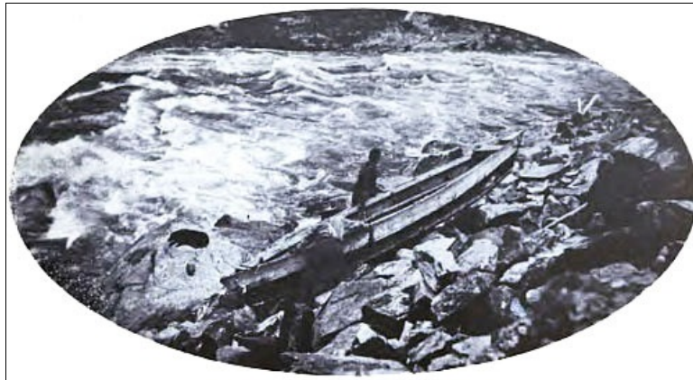
THE BIG BEND OF THE COLUMBIA RIVER

"We can't be far from the Boat Encampment here," said Rob, at last.