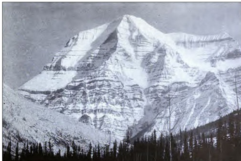
TOWERING ABOVE ALL, AND DWARFING ALL RIVALRY, THERE STOOD BEFORE THEM ONE GREAT NOBLE WHITE-TOPPED PEAK—MT. ROBSON