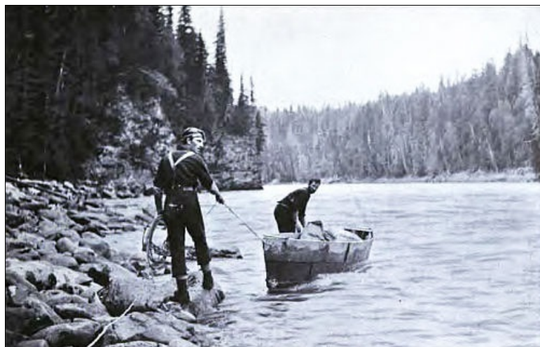
THE COLUMBIA RIVER, ABOVE THE BOAT ENCAMPMENT

"Why did they stop here?" asked John, after a time, busy with his pencil. "Couldn't they get any farther up?"