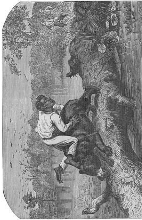
Blackie on Bear's Back

woods. Alexis wheeled round to fire after him; but, as he was raising his gun, his eye fell upon the negro, who was coming on over the log, and who had just got about halfway across it. The bear had by this time leaped up on the other end, and in a hurried gallop—that had been quickened by the report of Ivan's piece—was going right in the opposite direction. The negro, who saw the huge shaggy quadruped coming straight towards him, at once set up a loud "hulla-