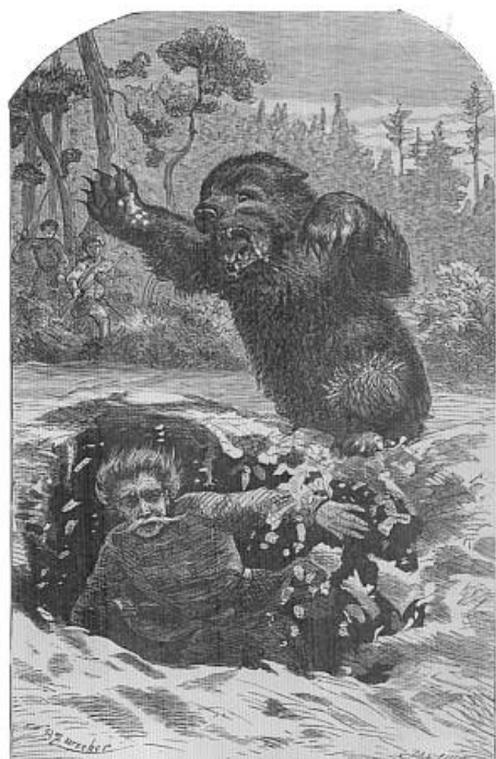
The Hunter Hunted

The chase led across the ravine, and of course over the bed of snow. The pursued was doing his best to escape. But the pursuer had the advantage—for while the man was breaking through at every step, the broad-pawed quadruped glided over the frozen crust without sinking an inch.