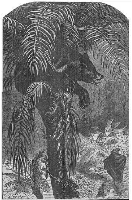
Bruin and the Dummy

striking resemblance to the sloth. Its long crescent-shaped claws strengthen this resemblance. A less distinctive name is that by which it is known to the French naturalists, "ours de jongleurs," or "juggler's bear." Its grotesque appearance makes it a great favourite with the Indian mountebanks; but, as many other species are also trained to dancing and monkey-tricks, the name is not characteristic.