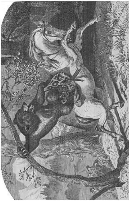
Ursus Thibetanus on Horseback

have a prominent place. He spends much of his time in searching for these—scratching them out of their holes, and turning over stones to get at them. Great boulders of rock, that a man could not move, he will roll over with his muscular arms; and large tracts of ground may be seen with the stones thus displaced.