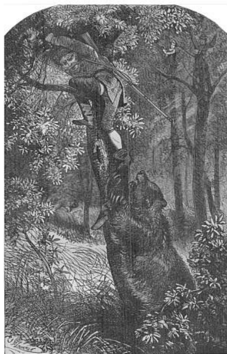
Pouchskin's Adventure with the Grizzly Bear

They had been fortunate, upon their route, to procure a skin of the “cinnamon” bear—as well as one of black colour with a white breast, both of which Alexis was able to identify as mere varieties of the ursus americanus . These varieties are sometimes seen to the east of the Rocky Mountains; but they are far more common throughout the countries along the Pacific—and especially in Russian America, where the cinnamon-coloured kind is usually termed the “red bear.” They occur, moreover, in the Aleutian islands; and very probably in Japan and Kamschatka—in which country bears are exceedingly numerous—evidently of several species, confusedly described and ill identified. Unfortunately, the Russian naturalists—whose special duty it has been to make known the natural history of the countries lying around the North Pacific—have done their work in a slovenly and childlike manner.