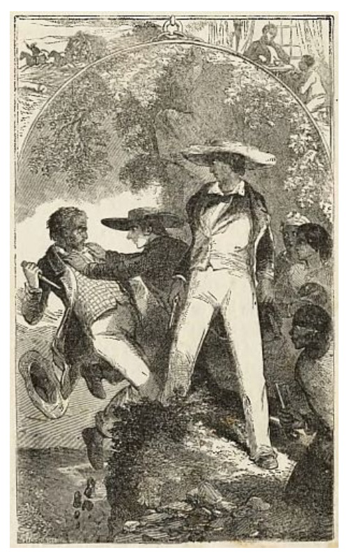
THE DEFENCE. But far is their way through the slave-dealing land,

Then off go the traders to find them more men, And off go the friends in their waggon again; But don't you wish well to the good man for life, Who would fight for his freedom, his child, and his wife?