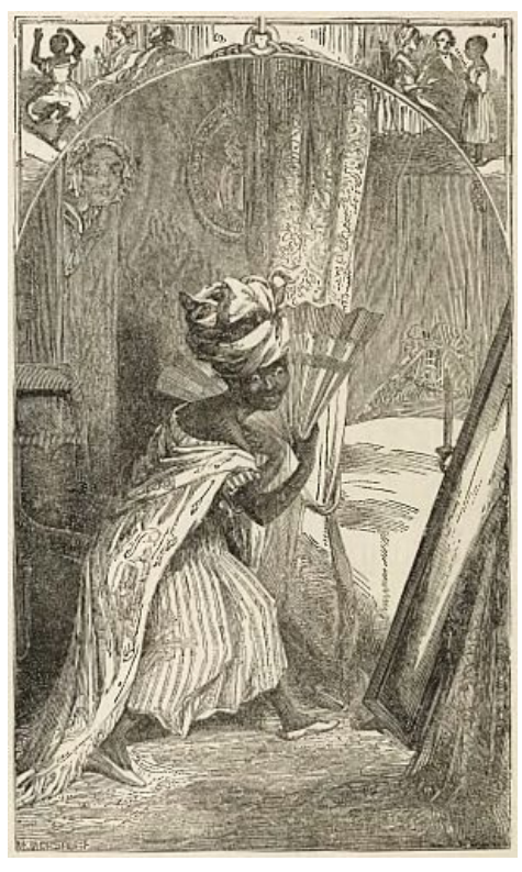
TOPSY AT THE LOOKING-GLASS. Mark where she stands! the shawl of gorgeous red Wound like a Turk's great turban round her head, A finer shawl for trailing on the floor, Just shows her bare black elbows, and no more.

A child whom bad men from her mother sold, Whom a harsh mistress used to cuff and scold, Whom no one taught or cared for all her days, No wonder that the girl had naughty ways.