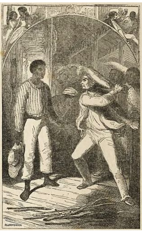
LEGREE STRIKING TOM. But little does that wicked man, In his angry madness, know, That God himself will take account Of each cruel word and blow.