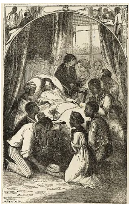
DEATH OF EVA. Oh, swift and sad were the tears that fell, As her gifts among them passed, And Tom, he got the first fair curl, And Topsy got the last.

"I'm going fast, where there will be No difference, but in sins forgiven, And mother it might chance that we Would bring poor Topsy flowers in heaven."