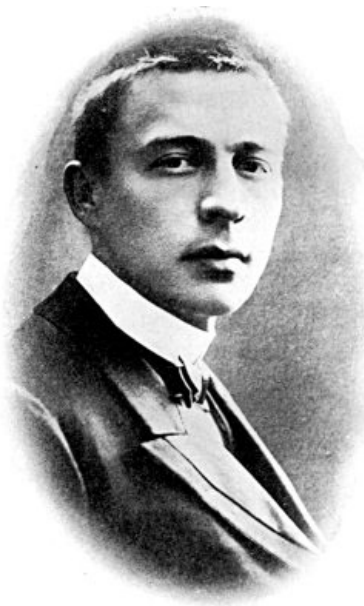
S. V. RACHMANINOFF