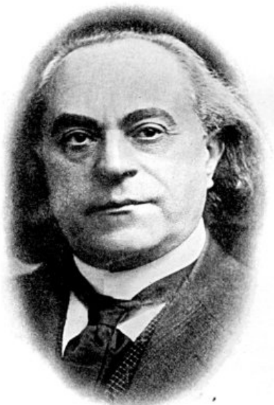
V. DE PACHMANN