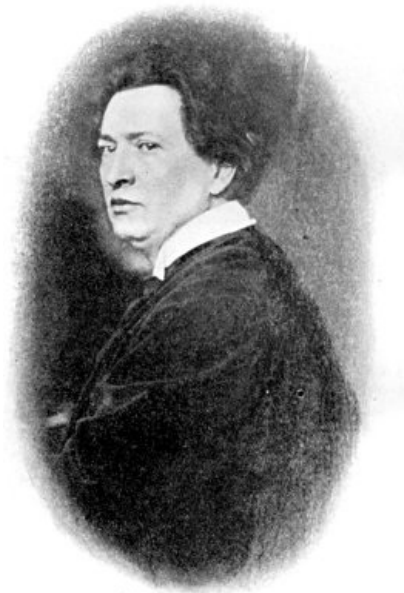
FERRUCCIO B. BUSONI