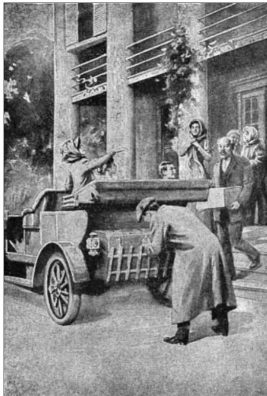
“THE PARTY CLIMBED INTO THE BIG MACHINE.” “Dorothy’s Triumph.”

“The good ship Ajax, out of Baltimore for the South Mountains. Four first and one second class cabins reserved for your party, Mr. Barlow.”