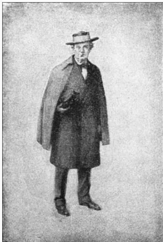
"HERR DEICHENBERG." "Dorothy's Triumph."

"I hope I find you vell dis morning, ladies," was his simple greeting.