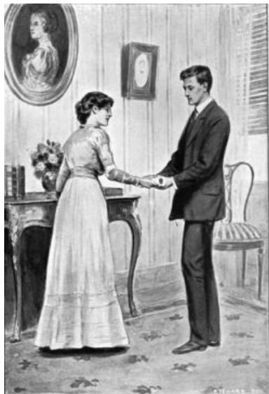
SHE PUT THE ROLL OF PAPER INTO HIS HAND