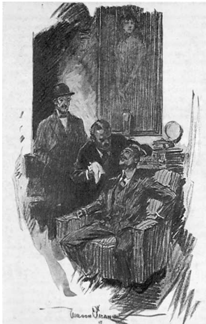
PULLING THEIR HAIR—RUBBING THEIR FACES WITH A CLEAN HANDKERCHIEF IN QUEST OF ANY TRACE OF "MAKE-UP" OR DISGUISE OF ANY SORT

"Oh, well, that's all right, then. I dare say there is very little likelihood of our man getting in whilst you and Sir Horace are here, and taking such a risk as stopping in the house until nightfall to begin his operations. Still, it was hardly wise, and I should advise hurrying back as fast as possible and taking at least one servant—the one you feel least likely to lose his head—into your confidence, Sir Horace, and putting him on the watch for my men. Otherwise, keep the matter as quiet as you have done, and look for me about nine o'clock. And rely upon this as a certainty: The Vanishing Cracksman will never get away with even one of those jewels if he enters that house to-night, and never get out of it unshackled!"