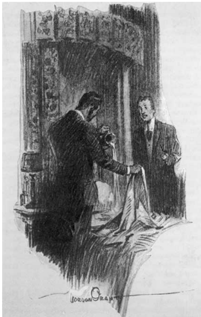
WITH THAT HE STRIPPED DOWN THE COUNTERPANE, LIFTED THE WATER-JUG FROM ITS WASHSTAND AND EMPTIED ITS CONTENTS OVER THE MATTRESSES

When he did see him, about an hour after his arrival at the divided house, he did know it, and decided forthwith, whatever the mysterious cause, foul play was there beyond the question of a doubt. Somebody had a secret reason for destroying this old man's life, and that some body was quietly and craftily doing it. But how? By what means? Not by poison, that was certain, for no poison could have this purely local effect and confine itself to the right side of the body, the right hand, the right arm, the right shoulder, spread to no other part and simply corrode the flesh and destroy the bone there as lime or caustic might, and leave the left side wholly unblemished, entirely without attack. Wholly unlike the case of old Mr. Bawdrey, in the affair of the "Nine-fingered Skeleton," this could be no poison that was administered by touch, injected into the blood through the pores of the skin; for whatsoever Captain Bridewell touched, his son touched after him, and no evil came of it to him. Then, too, there was no temptation of wealth to inherit, as in old Bawdrey's case, for the little that Captain Bridewell possessed would die with him. He had no expectations; he stood in no one's way to an inheritance. Why, then, was he being done to death?—and how?