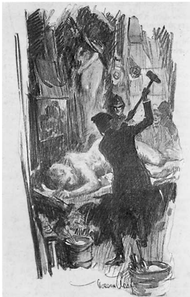
SWINGING THE HAMMER, HE STRUCK AT THE NYMPH WITH A FORCE THAT SHATTERED THE MONSTROUS THING TO ATOMS

"Oh, well, possibly one was 'flown' by him to you, and it 'homed' without your knowledge."