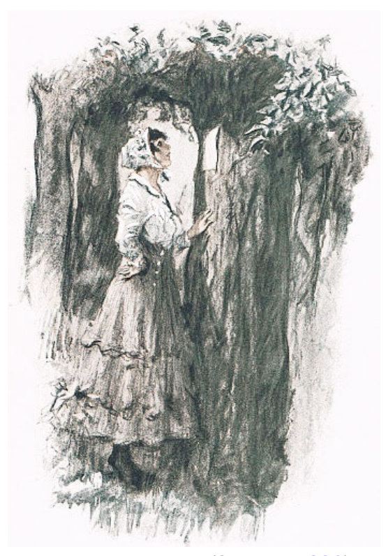
(See <u>page 220</u>) "Where twin oaks rustle in the wind There waits a lad for Rosalind"