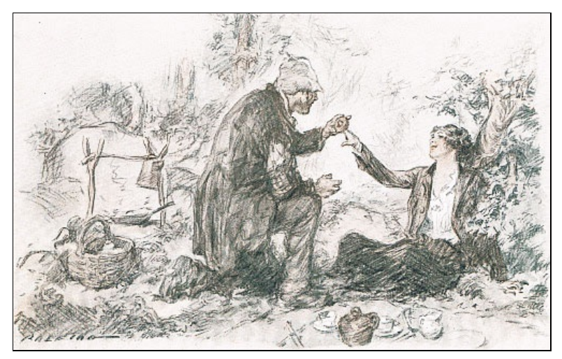
"If you wish a wish and eat it—all but the hole, you'll have what you've been wishin' for all your life."

So Patsy bit while the tinker checked them off on his fingers. "One, two, three, four, five, six. You'll get your wish by the seventh day, sure, or I'm no tinker."