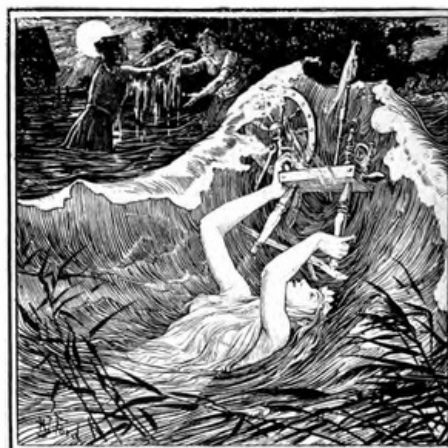
'A wave swept the spinning-wheel from the bank'

But the waters of the pond rose up suddenly, overflowed the bank where the couple stood, and dragged them under the flood. In her despair the young wife called on the old witch to help her, and in a moment the hunter was turned into a frog and his wife into a toad. But they were not able to remain together, for the water tore them apart, and when the flood was over they both resumed their own shapes again, but the hunter and the hunter's wife found themselves each in a strange country, and neither knew what had become of the other.