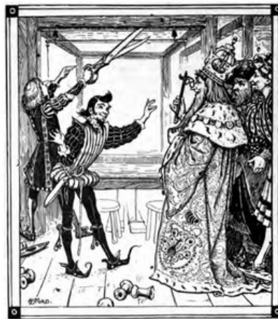
The Emperor comes to see his new clothes

'Yes,' said all the knights, but they could see nothing, for there was nothing there.