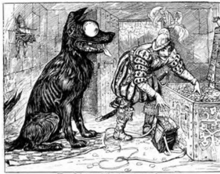
The Soldier fills his Knapsack with Money

'What do you want to do with the tinder-box?' asked the Soldier.