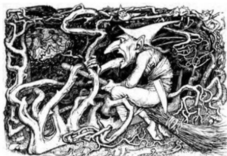
The comb grows into a forest

So the witch saw there was no help to be got from her old servants, and that the best thing she could do was to mount on her broom and set off in pursuit of the children. And as the children ran they heard the sound of the broom sweeping the ground close behind them, so instantly they threw the handkerchief down over their shoulder, and in a moment a deep, broad river flowed behind them.