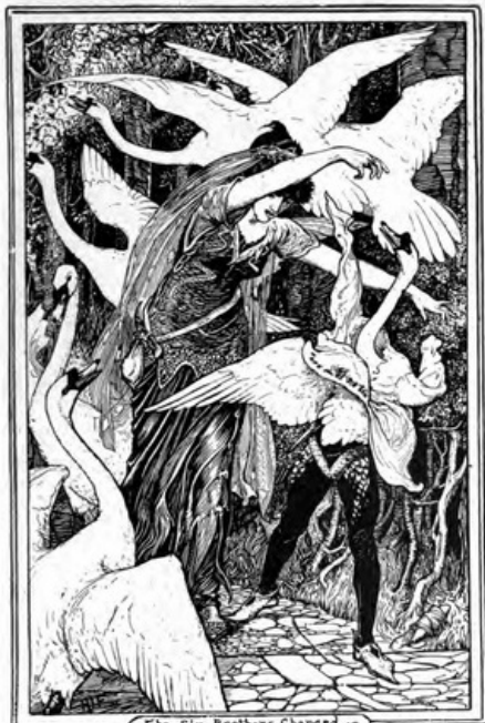
The Six Brothers Changed - Into Swans by Their - Stepmother .