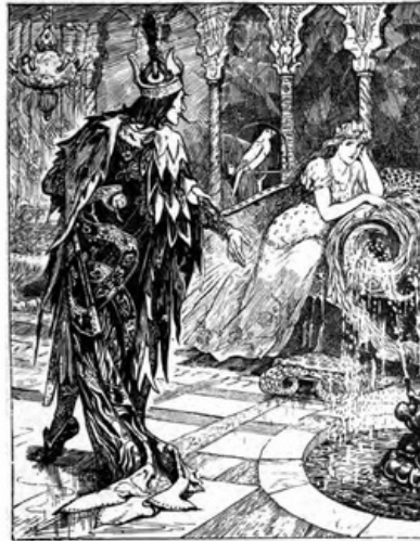
The Wizard King pays a visit to the Princess

When he saw her well-disposed towards him, he exclaimed: 'Madam, I have a most important secret to confide to you, and I beg you not to be alarmed by what I am about to say. I am here on behalf of the Queen your mother, with the object of delivering your Highness; to prove which, behold this portrait which she gave me herself.' So saying he drew forth the miniature from under his wing. The Princess's surprise was great, but after what she had seen and heard it was impossible not to indulge in hope, for she had recognised the likeness of herself which her mother always wore.