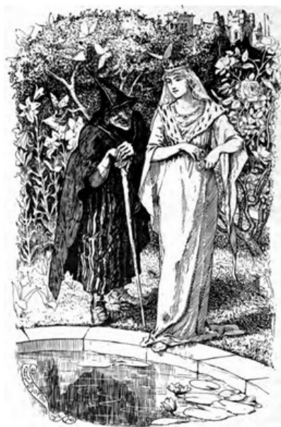
The witch persuades the Queen to bathe

'Why are you sad and cast down, fair Queen? You should not mope all day in your rooms, but should come out into the green garden, and hear the birds sing with joy among the trees, and see the butterflies fluttering above the flowers, and hear the bees and insects hum, and watch the sunbeams chase the dew-drops through the rose-leaves and in the lily-cups. All the brightness outside would help to drive away your cares, O Queen.'