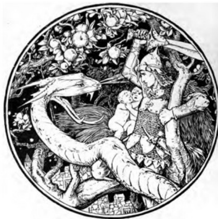
'Then the youth swung his mighty sword in the air, and with one blow cut off the serpent's head.'

'Then the youth swung his mighty sword in the air, and with one blow cut off the serpent's head'