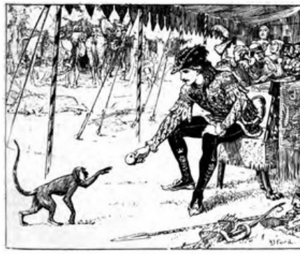
The King makes friends with the Green Monkey