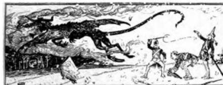
The Fiend defeated

Then the Dragon flew away with a loud shriek, and had no more power over them. But the three soldiers took the little whip, whipped as much money as they wanted, and lived happily to their lives' end.