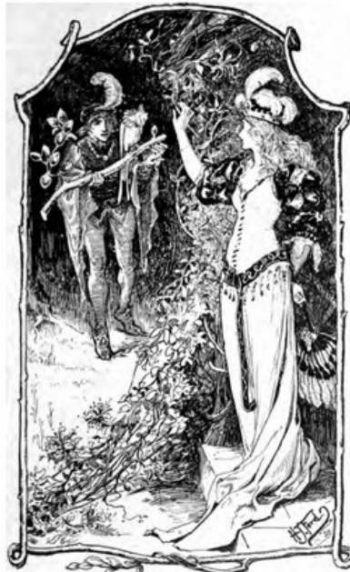
'STANDING IN THE DOORWAY A CHARMING MAIDEN AT WHOSE SIGHT HIS MIND SEEMED TO GIVE WAY'

The conversation was at this point, and bid fair to last some time longer, when one of the fairies appeared in her ivory car, accompanied by a beautiful woman past her early youth. At this moment the bird suddenly awakened, and, flying on to Saphir's shoulder (which it never afterwards left), began fondling him as well as a bird can do. The fairy told Serpentine that she was quite satisfied with her conduct, and made herself very agreeable to Saphir, whom she presented to the lady she had brought with her, explaining that the lady was no other than his Aunt Aglantine, widow of Diamantino.