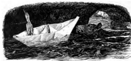
· DOWN · THE · DRAIN ·

So they made a little boat out of newspaper, put the Tin-soldier in it, and made him sail up and down the gutter; both the boys ran along beside him, clapping their hands. What great waves there were in the gutter, and what a swift current! The paper-boat tossed up and down, and in the middle of the stream it went so quick that the Tin-soldier trembled; but he remained steadfast, showed no emotion, looked straight in front of him, shouldering his gun. All at once the boat passed under a long tunnel that was as dark as his box had been.