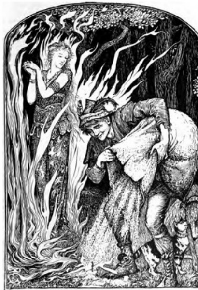
Martin extinguishes the flames

So they started on their way, and after much wandering they reached a spot where a great rock rose straight up in the middle of the road. Instantly the Serpent uncoiled itself from his neck, and, as it touched the damp earth, it resumed the shape of the lovely damsel. Pointing to the rock, she showed him an opening just big enough for a man to wriggle through. Passing into it, they entered a long underground passage, which led out on to a wide field, above which spread a blue sky. In the middle of the field stood a magnificent castle, built out of porphyry, with a roof of gold and with glittering battlements. And his beautiful guide told him that this was the palace in which her father lived and reigned over his kingdom in the Under-world.