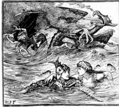
'But the waters seized her chariot and sunk it in the lowest depths'

moment he seized the egg and flung it at the bird with all his might, and lo and behold! instead of the ugly monster the most beautiful girl he had ever seen stood before the astonished eyes of the Prince.