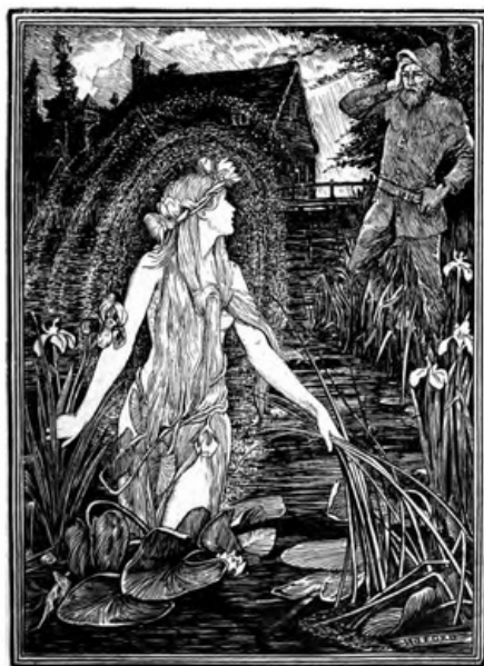
The miller sees the nixy of the mill pond

The poor miller was much horrified by these tidings, and went in to his wife with a heavy heart to tell her and his relations of the fatal bargain he had just struck with the nixy. 'I would gladly give up all the good fortune she promised me,' he said, 'if I could only save my child.' But no one could think of any advice to give him, beyond taking care that the child never went near the mill-pond.