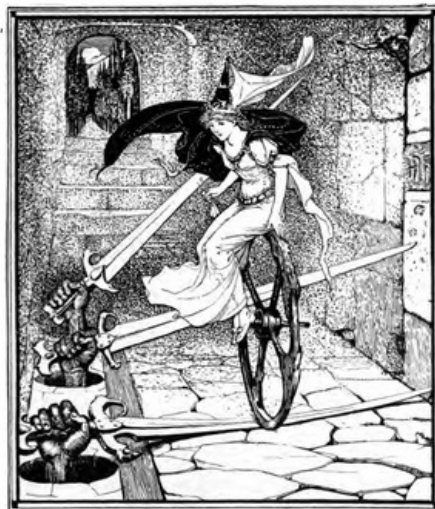
'Then she reached the three cutting swords, and got on her plough-wheel and rolled over them'

Then she reached the three cutting swords, and got on her plough-wheel and rolled over them. At last she came to a great lake, and, when she had crossed that, arrived at a beautiful castle. She went in and gave herself out as a servant, a poor maid who would gladly be engaged. But she knew that the Prince whom she had freed from the iron stove in the great wood was in the castle. So she was taken on as a kitchenmaid for very small wages. Now the Prince was about to marry another princess, for he thought she was dead long ago.