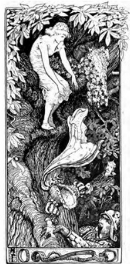
And then her dress'

But the King and the Queen with their six brothers lived many years in happiness and peace.