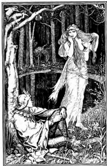
THE WITCH-MAIDEN SEES THE YOUNG MAN UNDER A TREE

The maiden answered kindly, 'Come and spend this night with us. You will sleep better on a pillow than on damp moss.'