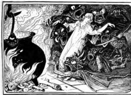
The evil spirits drag the girl to the cauldron

At the same moment the crow appeared and hopped all round the room with joy. It thanked the Princess most heartily for her goodness, and said that its sufferings had already been greatly lessened.