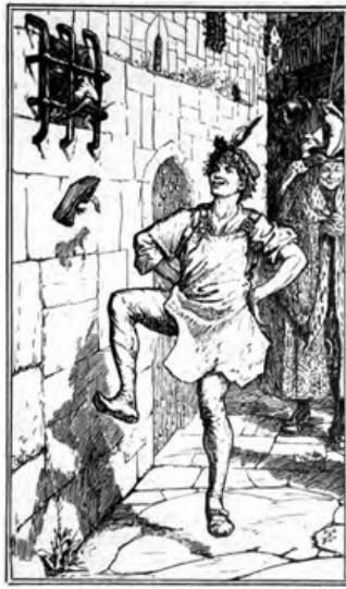
'He was skipping along so merrily'