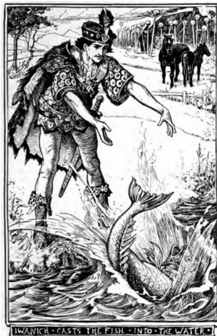
IWANICH - CASTS THE FISH - INTO - THE WATER.

In vain did the poor beast try to free itself; then the good-natured Prince came once more to the rescue, and let the fox out of the trap.