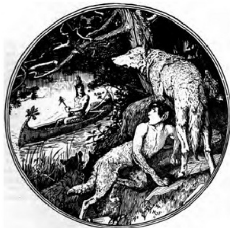
'My brother, my brother, I am becoming a wolf!'

But he would not listen, and, making no reply, he took his bow and arrows and left the hut. The snows fell and melted, yet he never returned; and at last the heart of the girl grew cold and hard, and her little boy became a burden in her eyes, till one day she spoke thus to him: 'See, there is food for many days to come. Stay here within the shelter of the hut. I go to seek our brother, and when I have found him I shall return hither.'