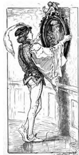
The Prince looks into the magic mirror

Perhaps the worst pain he had to bear was a sort of weight on his chest, which made it very hard for him to breathe. So he commanded his servants to leave the windows open in order that he might get more air. One day, when he had been left alone for a few minutes, a bird with brilliant plumage came and fluttered round the window, and finally rested on the sill. His feathers were sky-blue and gold, his feet and his beak of such glittering rubies that no one could bear to look at them, his eyes made the brightest diamonds look dull, and on his head he wore a crown. I cannot