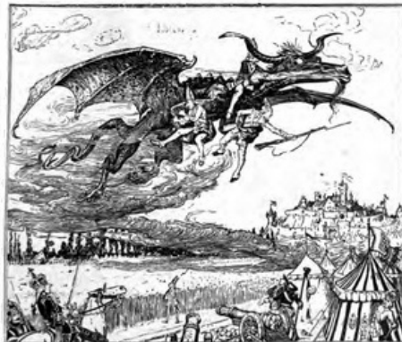
The Dragon carries off the three soldiers

He gave them a little whip, saying, 'Whip and slash with this, and as much money as you want will jump up before you. You can then live as great lords, keep horses, and drive about in carriages. But after seven years you are mine.' Then he put a book before them, which he made all three of them sign. 'I will then give you a riddle,' he said; 'if you guess it, you shall be free and out of my power.' The dragon then flew away, and they journeyed on with their little whip. They had as much money as they wanted, wore grand clothes, and made their way into the world. Wherever they went they lived in merrymaking and splendour, drove about with horses and carriages, ate and drank, but did nothing wrong.