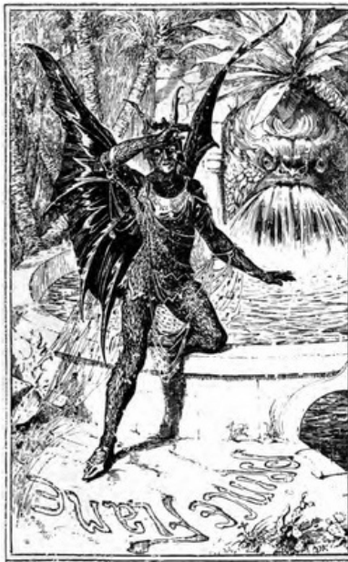
PRINCE GNOME LEARNS THE NAME OF HIS RIVAL AT THE GOLDEN FOUNTAIN