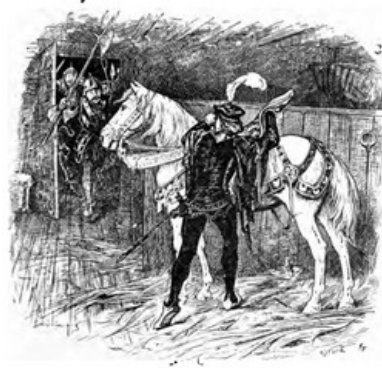
Prince Saphir steals the horse and harness