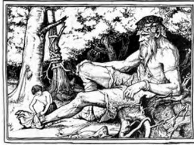
The Herd-boy binds up the Giant's foot.