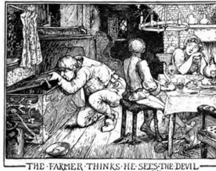
THE FARMER THINKS HE SEES THE DEVIL IN THE CHEST

Little Klaus gave the farmer his sack with the dry skin, and got instead a good bushelful of money. The farmer also gave him a wheelbarrow to carry away his money and the chest. 'Farewell,' said Little Klaus; and away he went with his money and the big chest, wherein sat the sexton.