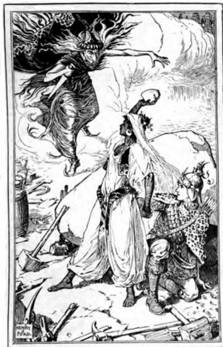
THE BLACK GIRL STOPS THE WITCH WITH A BIT OF THE ROCK

The Prince heard her words without anxiety, so entirely did he rely on the help of his black friend. Full of hope he hurried across the bridge, and recognised at once the spot where the castle was to stand, for spades, hammers, axes, and every other building implement lay scattered on the ground ready for the workman's hand, but of gold, silver, and precious stones there was not a sign. But before the Prince had time to feel despondent the black girl beckoned to him in the distance from behind a rock, where she had hidden herself for fear her mother should catch sight of her. Full of joy the youth hurried towards her, and begged her aid and counsel in the new piece of work he had been given to do.