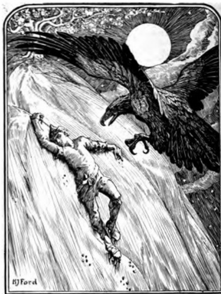
The boy attacked by the eagle on the Glass Mountain