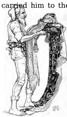
The fisherman brings the crab on the golden cushion

carried him to the castle, where the Crab presented the other garment to his bride. Now the ceremony took place, and when the married pair were alone together the Crab made himself known to his young wife, and told her how he was the son of the greatest king in the world, and how he was enchanted, so that he became a crab by day and was a man only at night; and he could also change himself into an eagle as often as he wished. No sooner had he said this than he shook himself, and immediately became a handsome youth, but the next morning he was forced to creep back again into his crab-shell. And the same thing happened every day. But the Princess's affection for the Crab, and the polite attention with which she behaved to him, surprised the royal family very much. They suspected some secret, but though they spied and spied, they could not discover it. Thus a year passed away, and the Princess had a son, whom she called Benjamin. But her mother still thought the whole matter very strange. At last she said to the King that he ought to ask his daughter whether she would not like to have another husband instead of the Crab? But when the daughter was questioned she only answered: