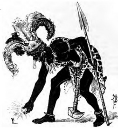
The Black King's Gift.

So the Hazel-nut child and his parents lived in happiness and prosperity after this till they died.