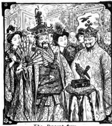
The Present from the Emperor of Japan

The Nightingale sang so gloriously that the tears came into the Emperor's eyes and ran down his cheeks. Then the Nightingale sang even more beautifully; it went straight to all hearts. The Emperor was so delighted that he said she should wear his gold slipper round her neck. But the Nightingale thanked him, and said she had had enough reward already. 'I have seen tears in the Emperor's eyes—that is a great reward. An Emperor's tears have such power!' Then she sang again with her gloriously sweet voice.