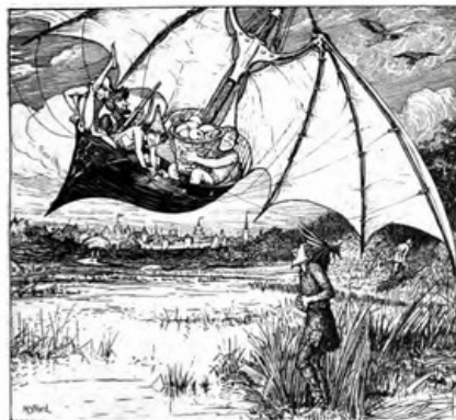
The comrades in the flying ship meet the drinker