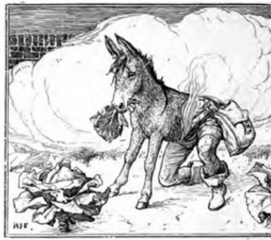
The hunter is transformed into a donkey