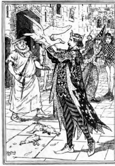
The King catches the White Duck