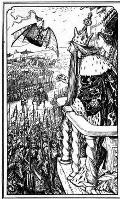
SIMPLETON'S ARMY APPEARS BEFORE THE KING

In the meantime the courtier, who had run all the way from the palace, reached the ship panting and breathless, and delivered the King’s message.