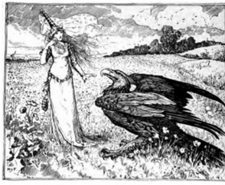
The Princess and the eagle in the flowery meadow