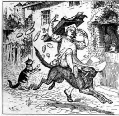
Schurka upsets the baker