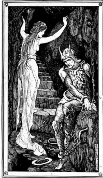
'HERE YOU SHALL REMAIN CHAINED UP UNTIL YOU DIE'

Now, if you had been the Prince, would you not rather have stayed with the pretty witch-maiden?