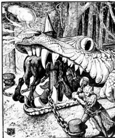
The youth secures the dragon