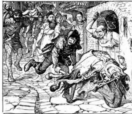
The shoemakers and tanners drive Big Klaus out of the town

'Aha!' said he when he came home, 'Little Klaus shall pay dearly for this. I will kill him!'