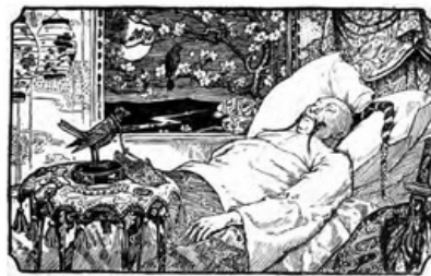
The true Nightingale sings to the Emperor

'You have done that already!' said the Nightingale. 'I brought tears to your eyes the first time I sang. I shall never forget that. They are jewels that rejoice a singer's heart. But now sleep and get strong again; I will sing you a lullaby.' And the Emperor fell into a deep, calm sleep as she sang.