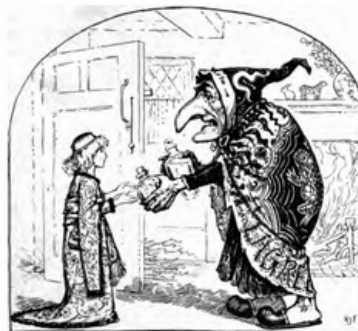
LACREE gives the 2 bottles to FAIRERTHANAFAIRY.

Several years passed, during which time the Princess grew accustomed to her lonely life, obeyed the Fairy's orders, and by degrees forgot all about the court of the King her father.