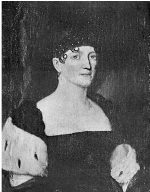
MRS. JAMES MONROE, NÉE KORTRIGHT, BY BENJAMIN WEST.