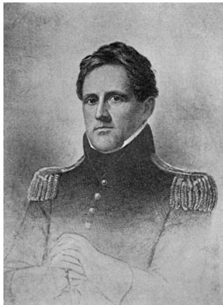
BRIGADIER GENERAL WINFIELD SCOTT, U.S.A., BY INGHAM.

The original portrait was burned many years ago.