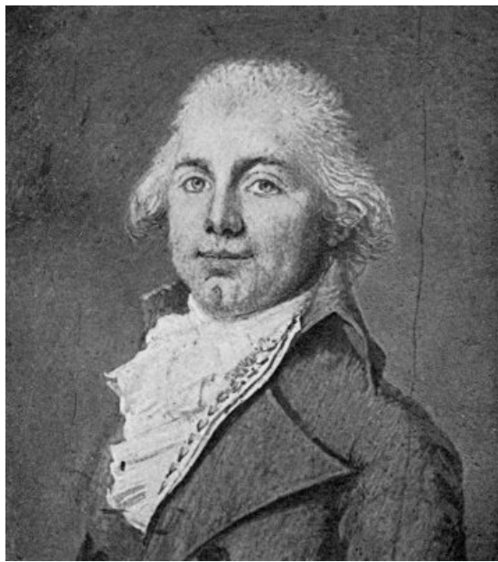
MINIATURE OF JAMES MONROE, PAINTED IN PARIS IN 1794, BY SEMÉ.