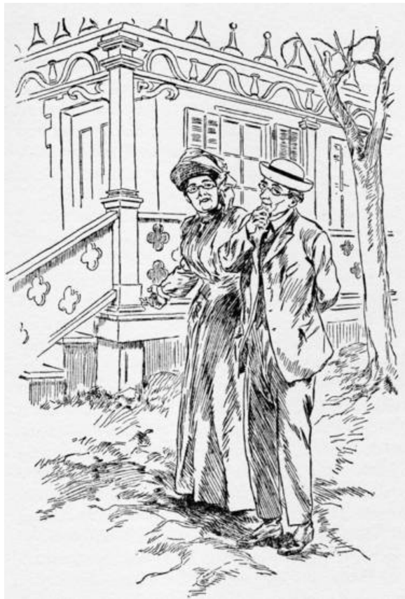
"The suller!" He stood agast, perfectly dumb-founded but wuzn't goin' to give in he had made a mistake. It wuz too mortifying to his pride." (See page 318)

"Well," sez he, a bright idee occurrin' to him, "it will be a first rate job for the men to do rainy days. In buildin' a house there hain't much a man can do durin' a hard thunder storm, or hail storm, but they can go right on with the suller jest as well as though it wuz a sunshiny day. That is one great thing that architects have heretofore overlooked, work that men can do durin' cyclones—I have met that want," sez he proudly.