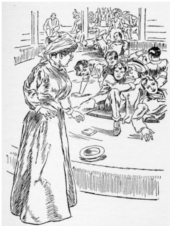
"Pretty soon it begun to move and one by one they wuz thrown off and went down I know not where." (See page 260)

"Describe him," sez she, "there wuz a man here just now hunting for some woman."