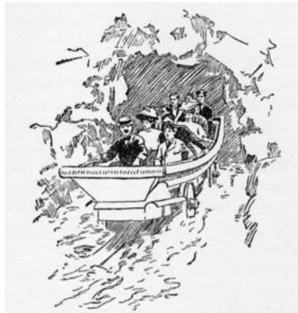
"We got in a small boat and wuz carried round and round till we dived into a dark tunnel."

I thought to myself, he probably thinks he'll have chances to sample it in the futur, but mebbly he wuz jest sulky. But I only sez to her, "It is the last place I ever laid out to go unless I wuz obleeged to. But lead on," sez I recklessly, "I'll foller." For the thought had come to me onbid, How did I know how fur Josiah Allen had back-slided? How did I know but I'd find him there?