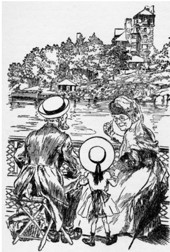
"I liked Castle Rest. It seemed a monument riz up to faithful, patient mothers by the hand of filial gratitude and love." (See page 48)

And pretty soon our boat sorter turned round and backed up graceful into Alexandria Bay, and we hitched it there and lay off agin the harbor real neighborly. There wuz two hotels there in plain sight, each one on 'em as long as from our house to Miss Derias Bobbetses, all fixed off with piazzas and porticos and pillows and awnin's and handsome colors from the basement clear up—up—up to the ruff, and the grounds laid out perfectly beautiful. Grass plats and terraces and long flights of stairs, and glowin' flower beds and summer houses and long smooth walks and short ones, and everything. And folks all the time santerin' up and down the terraces and walks, and up and down the piazzas and balconies.