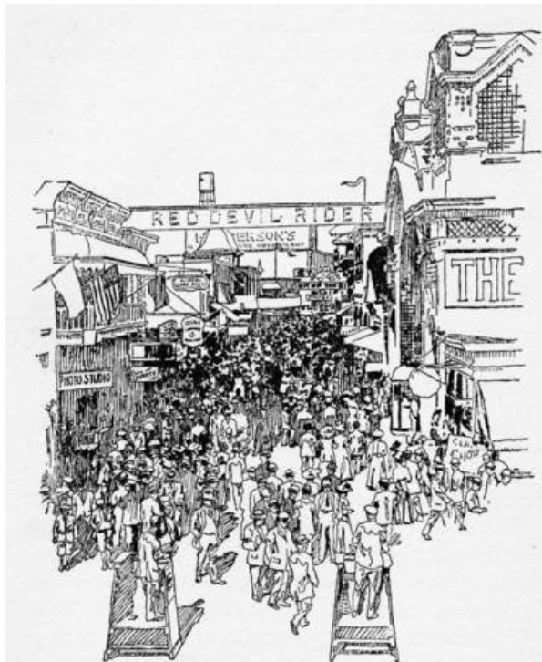
"I myself never sot foot on the Bowery; I wuzn't goin' to nasty up my mind with it, though I hearn there wuz some

Among 'em wuz that Mother's Camp, where thousands and thousands of poor children and their mas go to spend a day in the bracin' atmosphere. And the children have pure milk, and their mas good tea, and they can go there day after day all they want to. How the children look forward to it, and their mas too.