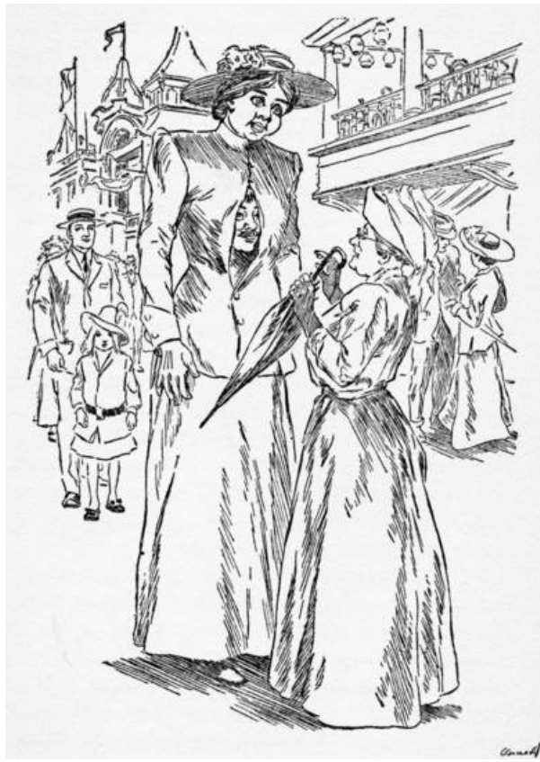
"I'm tellin' the livin' truth, as she towered up in front on me, her breast opened and a man's face looked out on me." (See page 253)

Settin' there lookin' off on them mighty everlastin' waves, forever flowin' back and forth, forth and back, the world of the flimsy and the false seemed to pass away and the Real more nigh to me than it did in the painted land of shams and onreality I had been passin' through. And as I meditated on the disgraceful sight I had seen—that gaudy, guilty creeter with a man concealed in her breast. For if it wuzn't a guilty secret, why wuz the door shet and fastened tight, till the searchlight of a woman's indignant eyes brought him to light?