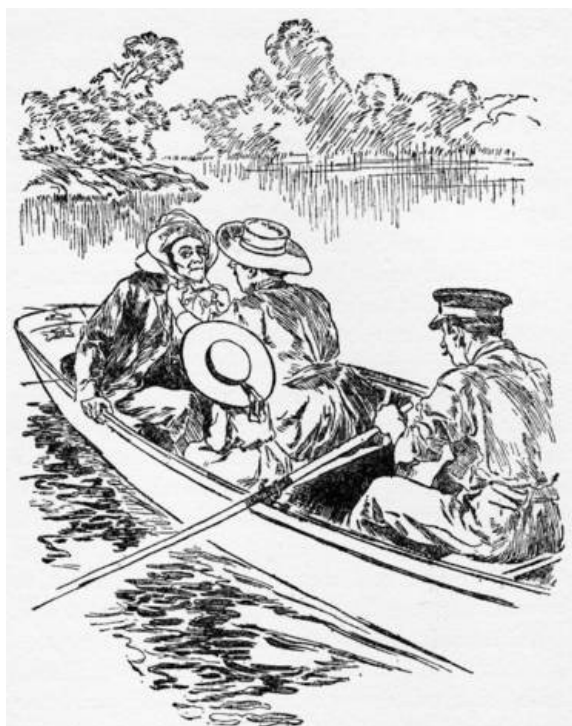
"I won't wear a veil," sez he stoutly. But the next time a gale come from the sou'west I laid the brim back and tied the veil in a big bow knot under his chin." (See page 82)

But the next time a gale come from the sou'west he wuz glad to submit to my drapin' him; so I laid the brim back and tied the veil in a big bow knot under his chin. Then agin he reviled the bow, and said it would make talk. But I held firm and told him I wuzn't goin' to tear my veil tiein' it in a hard knot. And he soon forgot his discomposure in wearin' braize veils, in his happiness at the idee of ketchin' fish, so's to tell the different deacons on't when he got home.