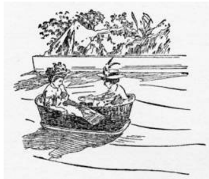
THE WITCHING WAVES "Folks get into little automobiles and steer 'em themselves." (See page 235)

"Oh," sez she, "I'm used to it, my papa owns a car." But 'tain't necessary to swear at 'em, it don't do no good, besides the wickedness on't.