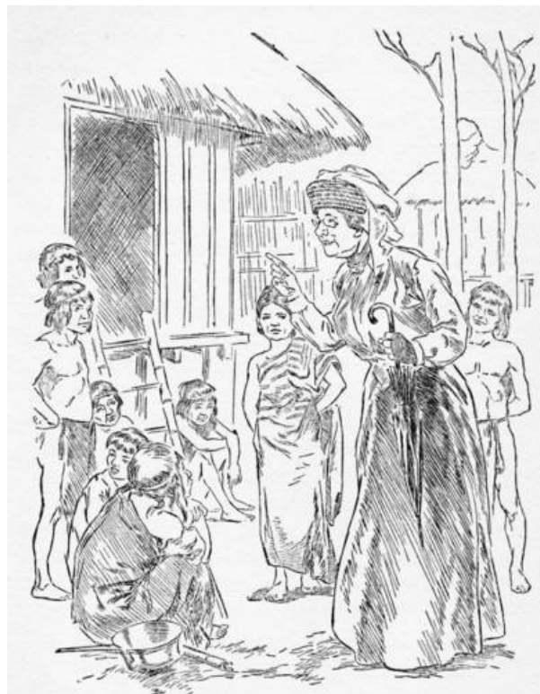
“I went forward to see the Head Hunters. I sez to 'em I've hearn of your doin's and I want to advise you for your good.” (See page 281)

So I sez to 'em, “I've hearn of your doin's, and I want to advise you for your good.” They looked at me real stiddy and I went on, “You may think you hain't so guilty because you only take folkses heads. But for the lands sakes! did you ever stop to think on't? What can they do without their heads? Of course,” sez I reasonably, “there is a difference in heads. Some folkses heads hain't got so much sense in 'em as others. I've seen 'em myself that I've thought a good wooden head would be jest as useful. But they are the best they've got, and they're attached to 'em, and they can't git along without 'em. And I always thought you might jest as well take their hull bodies whilst you wuz about it. Don't you see that is so? When it is pintoed out to you by a P. A.?”