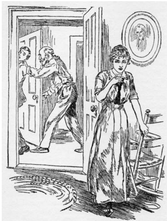
"The old deacon couldn't stand such talk. He turned him outdoors, slammed the door in his face, and forbid Faith to speak to him again." (See page 13)

He writ to her burnin' words of love and passion, for he loved her too in the old-fashioned way Adam did Eve—no other woman round, you know. And the words he writ wuz, I spoze, enough to melt a slate stun, let alone a heart, tender and true. She never writ a word back, and at last she wouldn't read his letters and sent 'em back onopened. That madded him and he went on from bad to worse, swung right out into wickedness. He seemed to git harder and harder, and finally seein' he could make no more impression on Faith than he could on white clear crystal, he went off west, as fur as Michigan at first, so I hearn, and so on, I don't know where to.