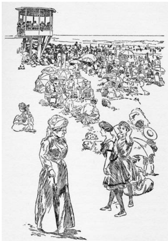
"It wuz a sight to see, acres and acres of sand dotted with men, wimmen, and children." (See page 286)

But where wuz Josiah? On every side wuz folks settin' and walkin', and mounds of sand with sometimes a head stickin' out, or a foot, or a arm, or a nose. I had hard work to keep from treadin' on 'em. There would be little hillocks of sand with mebbly a child's head or foot stickin' out.