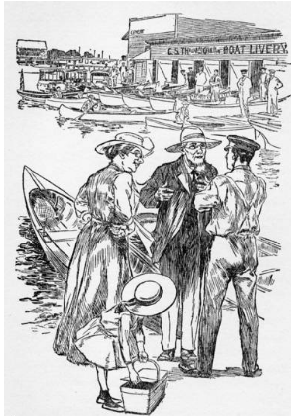
“I tried to stop him. I didn't want him to demean himself before the oarsmen tryin' to find boats that hadn't been hearn on in hundreds of years.” (See page 67)

I tried to stop him. I didn't want him to demean himself before the oarsmen and onlookers by tryin' to find boats that hadn't been hearn on in hundreds of years. But I couldn't git the idea out of his head till after dinner. Then he wuz more meller and inclined to listen to reason. It wuz a oncommon good meal, and he felt quite softened down in his mean by the time he finished. And Whitfield's boatman he'd engaged come with a good sizeable boat and we sot sail for Shadow Island.