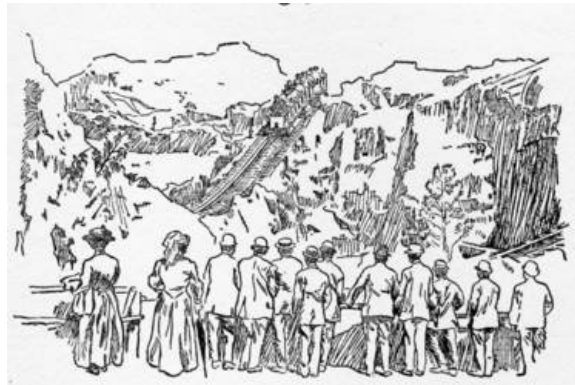
"On we went under the waterfall, up, up, down, down, and finally shot out jest where we got in." (See page 232)

"Oh!" I groaned out in agony, "what have I ever done to merit this! Have I ever been mean enough to Josiah?" But there they wuz, fiery pits, big devils and little ones with pitchforks and darts, etc. Only one thought assuaged my torment, my Josiah wuzn't there. But in a minute up we went, up—up—and come out to an open place, where I see what I thought wuz Heaven, but it wuz only Coney Island, but after what I'd been through even that worldly frivolous spot looked heavenly to me. On we went under the waterfall, up, up, down, down, through hot countries and cold, and finally shot out jest where we got in.