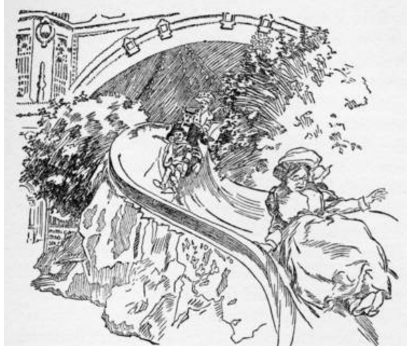
"As I went down with lightnin' speed I had'nt time to think much." (See page 258)

All to once, another wind sprung up from nowhere seemin'ly, and tried its best to blow off my bunnet. But thank Heaven, my good green braize veil tied round it with strong lutestring ribbon, held it on, and I see I still had holt of my trusty cotton umbrell, though the wind had blowed it open, but I shet it and grasped it firmly, thinkin' it wuz my only protector and safeguard now Josiah wuz lost, and I hastened away from that crazy spot.