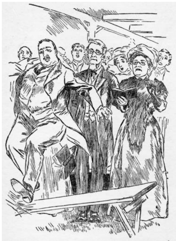
"Mr. Pomper, thinkin' he would see better, got up on the bench, and jest as he shouted out 'How firm a foundation,' the bench broke and down he come." (See page 168)

As I looked round me, I liked the place more and more. What need wuz there of upholstery and carpets? Brussels never turned out such a carpet as old Mom Nater had spread all round that Temple of hewn. Old Gobelin never wove such tapestry. No Empress of the wonder-laden East ever had hung in her boodore such a marvelous green texture as drooped down in emerald canopies above us. No golden lamp ever gin such a light as sifted down over the matchless green overhead, to light that solemn sanctuary. No organ ever gin out such sweet sound as the birds warbled anon or oftener. No jeweled ornaments ever sparkled on an altar like the emerald and gold winged butterflies flutterin' round that sacred hant, amongst the wild flowers that blossomed even up to the door. And it seemed as if the soul could soar up easier somehow when you could look right into the blue mystery of the sky, the trackless path that souls mount up on in prayer and praise. Somehow plaster and mortar seem more confinin'. Though I d'no as it really makes any difference. Heaven is over all, and the soul's wings can pierce the heaviest material, bein' made in jest that strong and delicate way, but yet it seemed more free and soarin' somehow, and as if the path heavenward wuz clearer.