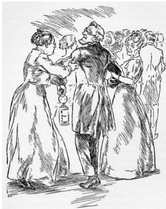
"As they come nigh me I riz up almost wildly and ketched holt of my pardner and sez I: 'Desist! Josiah Allen, stop to once!' The aged female looked at me in surprise." (See page 131)

Even in that awful moment my powers of deep reasonin' didn't desert me and I said: