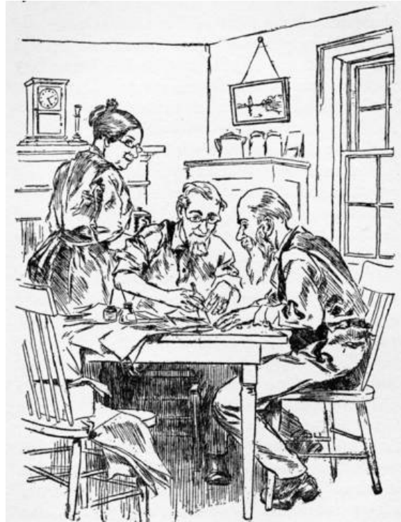
"And then he would call in Uncle Nate Peedick and they would bend their two gray bald heads and talk about specifications and elevations till my brain seemed most as soft as theirs." (See page 195)

He would roll up his sleeves, moisten his hands, and go to work early in the mornin', and set and pour over 'em all day, every stormy day, and every night he sot up so late goin' over 'em that he most undermined his health, to say nothin' of the waste of my temper and kerseen. And then he would call in uncle Nate Peedick and they would bend their two gray bald heads together and talk about "specifications" and "elevations" and "ground plans" and "suller plans" till my head seemed to turn and my brain seemed most as soft as theirs.