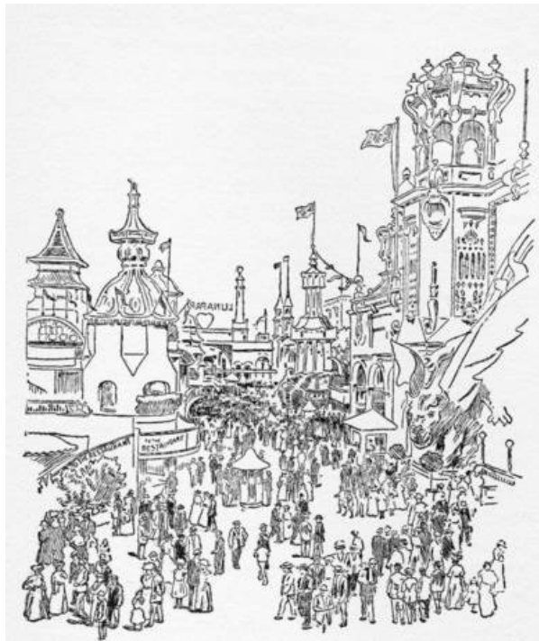
"I stood before what seemed to be a great city. Endless white towers riz up as if callin' attention to 'em." (See page 226)

I see she wuz lunny as the park, but didn't argy, and passed on furder when a man out of a row of great tall men dressed in red, took the piece of paper from me. He took it right out of my hand, and if there is anything wrong goin' on between him and the girl that gin it to me I hain't to blame, and want it understood that I hain't.