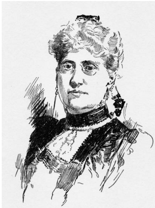
Marietta Holley [Samantha]