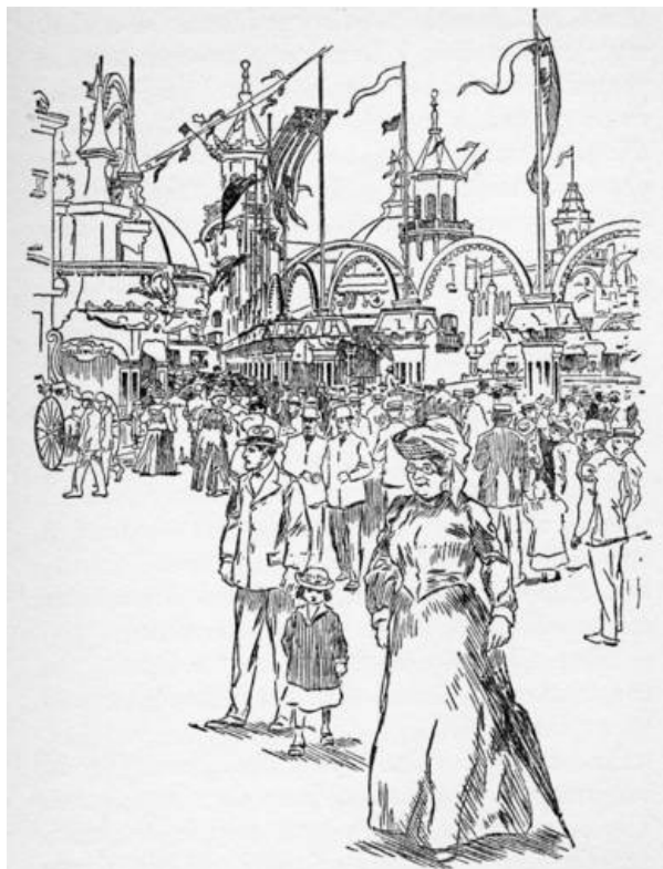
"As I went into Dreamland it seemed as if all the folks in the city was there." (See page 266)

As I went into Dreamland Park, it seemed agin as if all the folks in the city wuz there in the immense inner court, surrounded by amusements on every side. They wuz comin' and goin', talkin', laughin', hurryin', santerin', to and fro, fro and to. Lots on 'em talkin' language I never hearn before, but I thought, poor things, you never had the advantage of livin' in Jonesville, so I overlooked it in 'em.