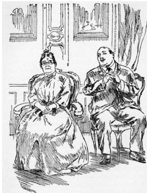
"'No,' sez Mr. Pomper, 'I want it done as speedily as possible, fer my late lamented left me thirteen children, two pairs of triplets, two ditto of twins, and three singles.'" (See page 143)

"My wealth lays in land mostly. I never believed in idle luxuries, only comfort, solid comfort, and my wife will have a luxurious home of a story and a half upright, and a linter, groceries and necessaries all provided, and all she will have to do will be the housework and gently train and care for the minds and bodies of the little ones, with some help from the oldest set of triplets, and make my home agin an oasis of joy, a Eden below. Oh! how happy she will be!" sez he, "Nestlin' down like a wanderin' dove in the safety and peace and pride of married life. When can I see Miss Smith?" sez he. "Or will you tell her in advance of her good fortune?"