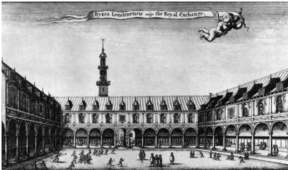
Royal Exchange, London. As it was in the time of the Virginia Company.