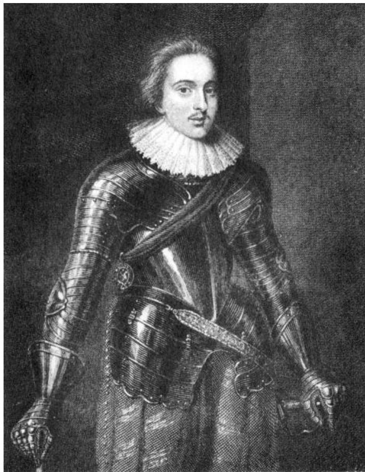
HENRY STUART Prince of Wales