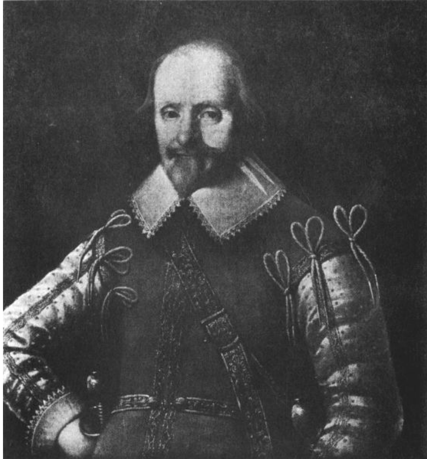
Sir Thomas Smith (or Smythe)

"The Right Worshipful Sir Thomas Smith, of London, Knight, one of his Maiesties Councill for Virginia, and Treasurer for the Colonie, and Gouvernour of the Companies of the Moscovia and East India Merchants"