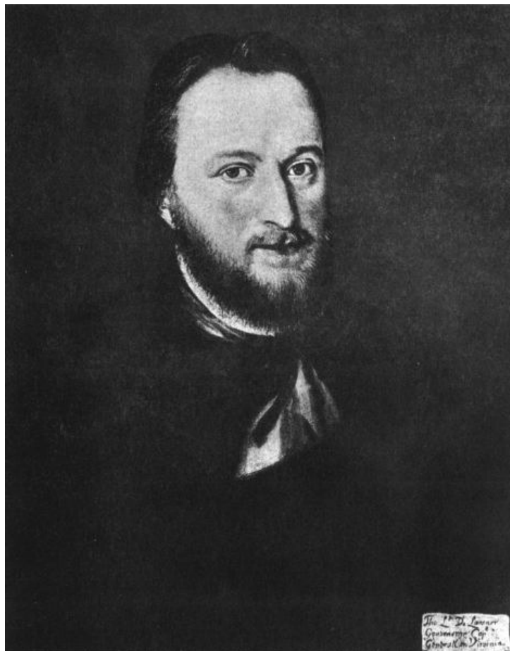
Thomas West, Third Lord de la Warr