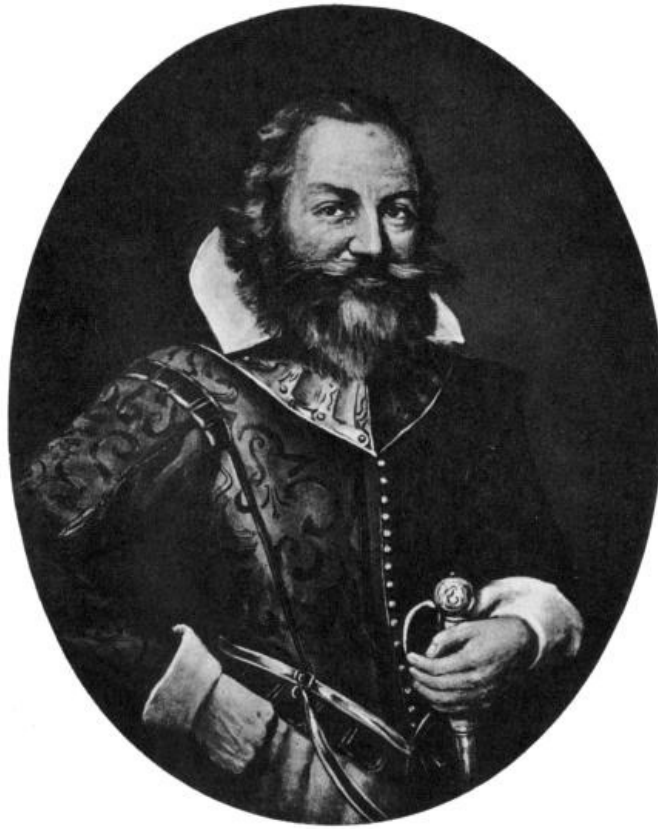
Captain John Smith