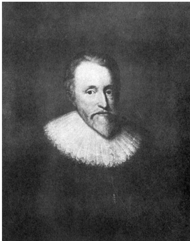
Sir Edwin Sandys

From The London Company of Virginia (New York and London, 1908)