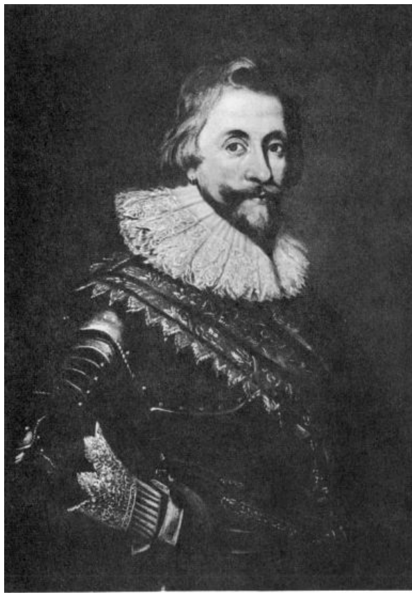
Henry Wriothesley (Third Earl of Southampton) from the painting by Michiel Jansz van Miereveldt

Henry Wriothesley (Third Earl of Southampton) From the painting by Michiel Jansz van Miereveldt