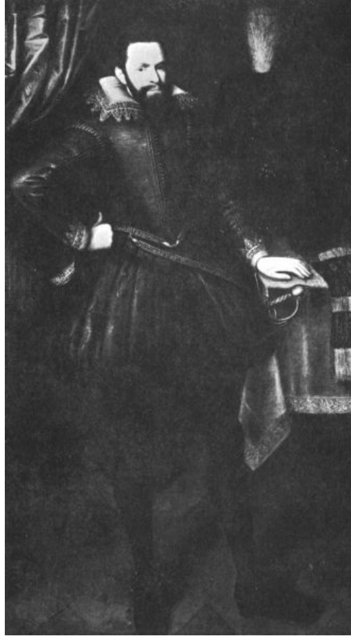
Sir Thomas Dale