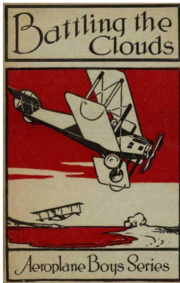
Battling the Clouds Aeroplane Boys Series

*** START OF THE PROJECT GUTENBERG EBOOK BATTLING THE CLOUDS; OR, FOR A COMRADE'S HONOR ***