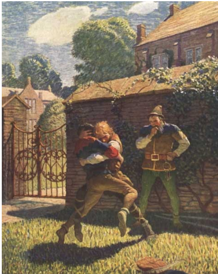
ROBIN WRESTLES WILL STUTELEY AT GAMEWELL "Catch him by the middle," he shouted. "Now you have him, lording, fairly. Throw him prettily!" And sure enough Stuteley came down.

"Catch him by the middle," he shouted. "Now you have him, lording, fairly. Throw him prettily!" And sure enough Stuteley came down.