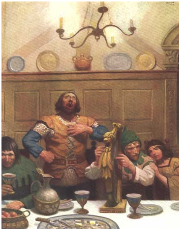
LITTLE JOHN SINGS A SONG AT THE BANQUET That evening, whilst Monceux raged and stormed without, they all sat to a great feast.

"You need say no more, Sir Richard," interposed Robin. "'Tis we who owe all to you. As for your debt, why, it hath been repaid me already by my lord of Hereford. Is it not so, Stuteley?"