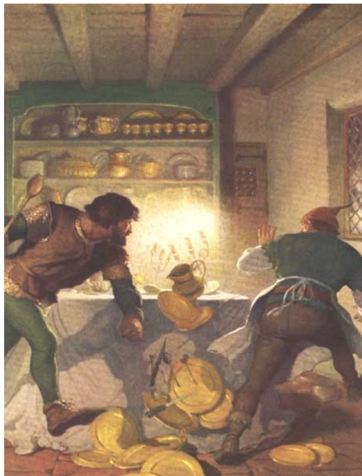
LITTLE JOHN FIGHTS WITH THE COOK IN THE SHERIFF'S HOUSE

At last he made a dart upon Roger and the chase grew furious. Dishes, plates, covers, pots and pans