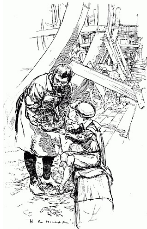
"'TIS THE PICTURE,' SAID HE PROUDLY, 'OF MY OLD SHIP, "THE GOLDEN VENTURE"'"

"And so," the story ended, "the breath of the Lord went forth and the storm blew, and fell on the fleet of Spain, and scattered them; and they went down in our very waters, they and their arms and their treasure, their guns and their gunners, their mariners and their men-of-war. And the remnant was scattered and driven northward, and some were wrecked on the rocks, and some our ships met and dealt with, and some poor few made shift to get back across the sea, trailing home like wounded mallards, to tell the King their master what the Lord had done for England."