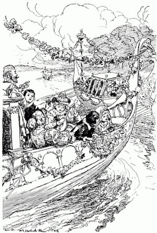
"THE GALLEY WAS DECKED WITH FRESH FLOWERS" [Page 102]