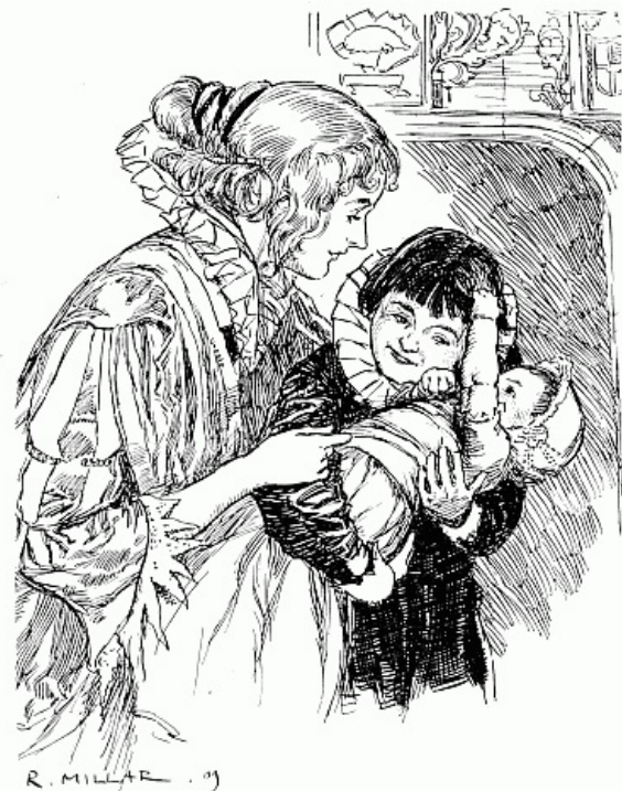
"IT HURT, BUT DICKIE LIKED IT"

It was the happiest moment of his life to Dickie. The little horse—the gold pieces. . . . Yes, but much more, the sudden, good, safe feeling of father and mother and little brother; of a place where he belonged, where he loved and was loved. And by his equals. For he felt that, as far as a child can be the equal of grown people, he was the equal of these. And Beale was not his equal, either in the graces of the body or in the inner treasures of mind and heart. And hitherto he had loved only Beale; had only, so far as he could remember, been loved by Beale and by that shadowy father, his "Daddy," who had died in hospital, and dying, had given him the rattle, his Tinkler, that was Harding's Luck. And in the very heart of that happiest moment came, like a sharp dagger prick, the thought of Beale. What wonders could be done for Beale with those twenty-five gold sovereigns? For Dickie thought of them just as sovereigns—and so they were.