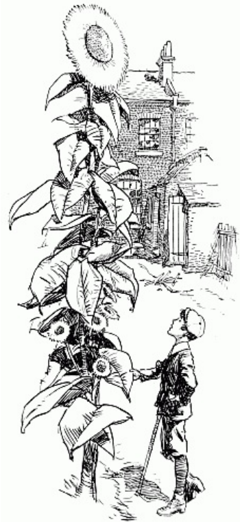
"IT IS A MOONFLOWER, OF COURSE," HE SAID"