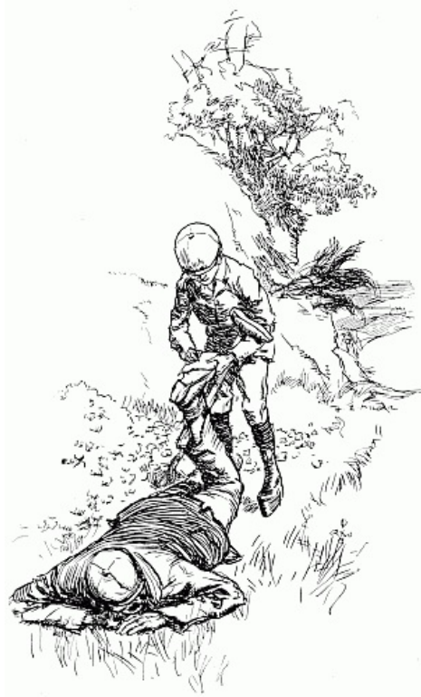
"HE LAY FACE DOWNWARD ON THE ROAD AND TURNED UP HIS BOOT"