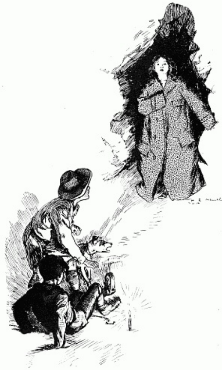
"ELFRIDA!" SAID BOTH BOYS AT ONCE