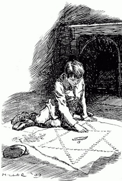
"HE MADE, WITH TRIPLE LINES OF SILVERY SEEDS, A SIX-POINTED STAR"