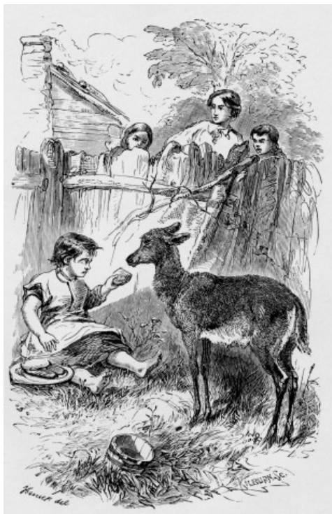
BUB AND THE FAWN. Page 64.