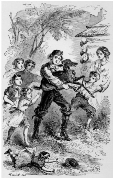
CAPTURE OF THE FAWN. Page 20