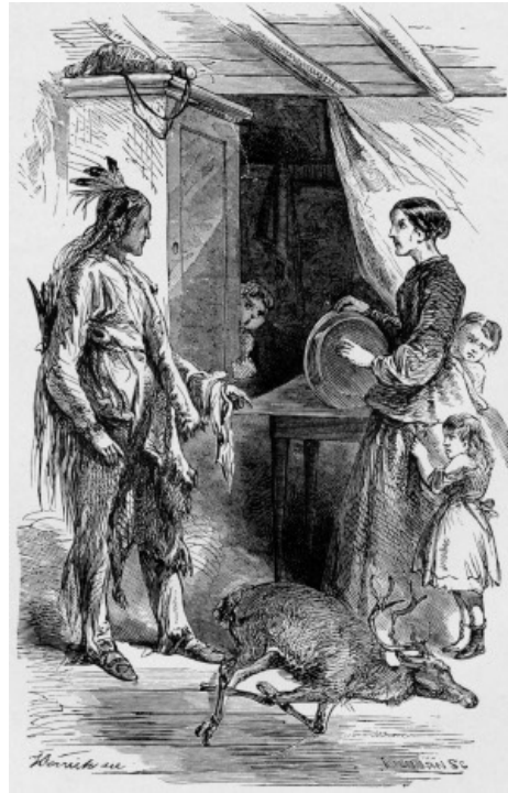
LONGHAIR AND HIS PRESENT. Page 186.

shoulder, which he deposited at her feet, saying, as he left,—for he tarried not to sit down,—“White squaw, much good; Long Hair bring venison,” Mrs. Jones wiped the tears from her eyes, rejoicing more to find that there was gratitude even in an Indian’s heart, than at receiving his generous gift.