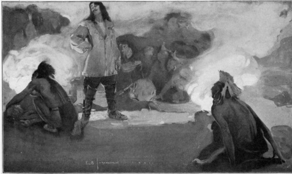
"Menard stood ... smiling with the same look of scorn he had worn ... when they led him to the torture."

He is glad that the fool speaks only for himself and not for the brave men of the Long House." He walked deliberately back and resumed his seat by the maid.