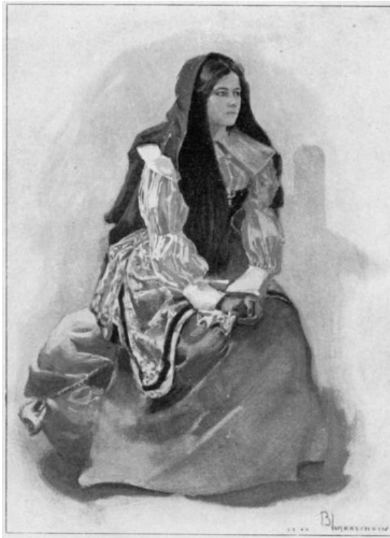
"Sitting on a bundle was, a girl, perhaps eighteen or nineteen years old."

Sitting on a bundle, a rod away, was a girl, perhaps eighteen or nineteen years old, wearing a simple travelling dress. Her hands were clasped tightly in her lap, and she gazed steadily out over the water with an air that would have been haughty save for the slight upward tip of her nose.