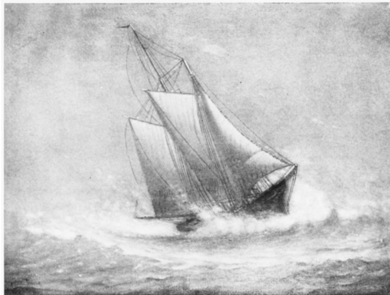
SHE WAS BEATING LABORIOUSLY INTO A VIOLENT HEAD WIND.