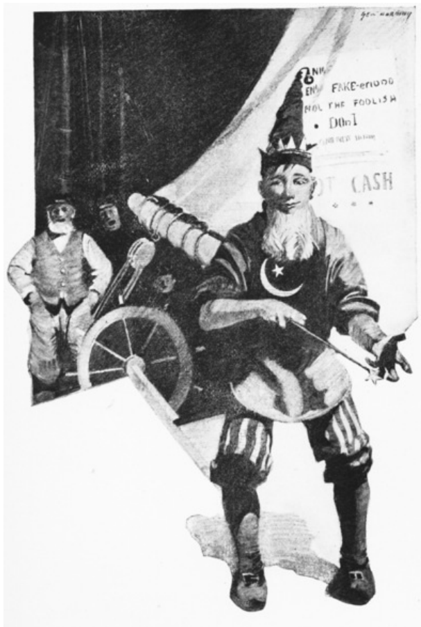
SEÑOR FAKERINO CREATED APPLAUSE BY EXTRACTING HALF DOLLARS FROM VACANCY.