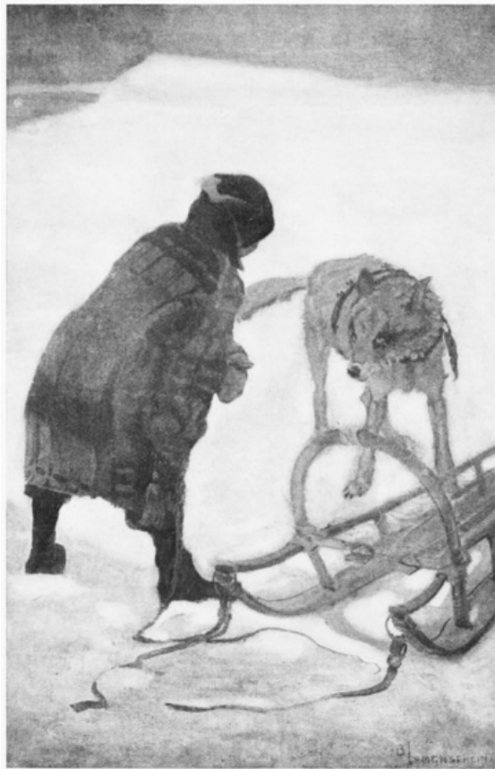
TOG THAWED INTO LIMP AND SERVILE AMIABILITY.

It was Jimmie Grimm who first put Tog in the traces. This was in the early days of Tog's first winter--and of Jimmie's seventh. The dog was a lusty youngster then; better nourished than the other dogs of Jim Grimm's pack, no more because of greater strength and daring than a marvellous versatility in thievery. In a bored sort of way, being at the moment lazy with food stolen from Sam Butt's stage, Tog submitted. He yawned, stretched his long legs, and gave inopportune attention to a persistent flea near the small of his back. When, however, the butt of Jimmie's whip fell smartly on his flank, he was surprised into an appreciation of the fact that a serious attempt was being made to curtail his freedom; and he was at once alive with resentful protest.