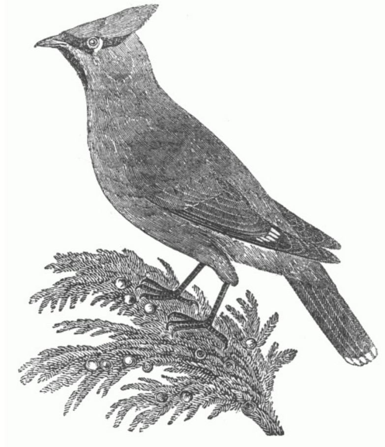
CEDAR BIRD. ( Ampelis Americana .)

The Rice Bunting is seven inches and a half long, and eleven and a half in extent. His spring dress is as follows: upper part of the head, wings, tail, and sides of the neck, and whole lower parts, black; the feathers frequently skirted with brownish-yellow, as he passes into the color of the female; back of the head, a cream color; back, black, seamed with brownish-yellow; scapulars, pure white; rump and tail coverts the same; lower part of the back, bluish-white; tail, formed like those of the Woodpecker genus, and often used in the same manner, being thrown in to support it while ascending the stalks of the reed; this habit of throwing in the tail it retains even in the cage; legs, a brownish flesh color; hind heel, very long; bill, a bluish-horn color; eye, hazel. In the month of June this plumage gradually changes to a brownish-yellow, like that of the female, which has the back streaked with brownish-black; whole lower parts, dull-yellow; bill, reddish-flesh color; legs and eyes as in the male. The young birds retain the dress of the female until early in the succeeding spring. The plumage of the female undergoes no material change of color.