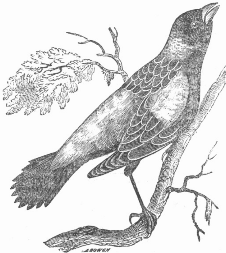
RICE BUNTING. ( Emberiza Oryzivora . WILSON.)

the tribe, but his character vindicated by his bravery, and the victory achieved, he retires from his fraternity to assist his mate in the formation of her nest. The flesh of the Meadow-Lark is white, and for size and delicacy, it is considered little inferior to the Partridge. In length, he measures ten and a half inches, in alar extent, nearly seventeen. Above, his plumage, as described by Nuttall, is variegated with black, bright bay, and ochreous. Tail, wedged, the feathers pointed, the four outer nearly all white; sides, thighs, and vent, pale ochreous, spotted with black; upper mandible brown, the lower bluish-white; iris, hazel; legs and feet, large, pale flesh-colour. In the young bird the color is much fainter than in the adult.