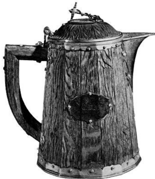
Figure 13.--Silver-mounted tankard presented to Cyrus W. Field by the workmen of Central Park, New York City. Loan of Metropolitan Museum of Art. In Division of Political History. (Acc. 64761, cat. 26209;)

Field continued to be active in many business enterprises but the last years of his life were