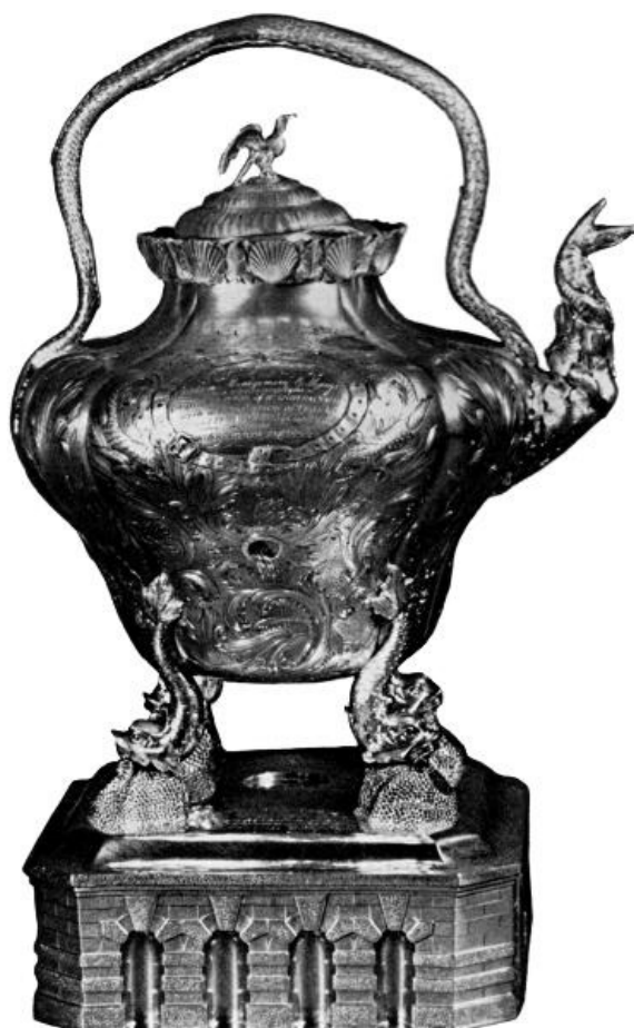
Figure 11.--Teakettle and stand given to Gen. Montgomery C. Meigs in 1853 by the citizens of

Presented to Captain Montgomery C. Meigs U.S. Engineers by the Corporation of Washington with a Resolution of Thanks approved 12th March 1853 for his Report on the Washington Aqueduct.