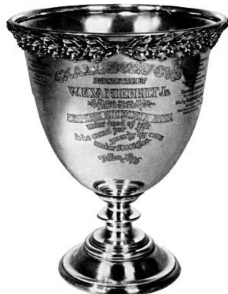
Figure 20.--The Vanderbilt Cup, an annual award for automobile races in the early 20th century. Gift of William K. Vanderbilt, Jr. In Division of Transportation. (Acc. 131820, cat. 310894;)

On the inside of the stem is marked "Tiffany and Co." and "35 pints."