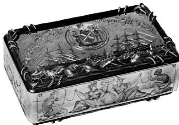
Figure 12.--Gold box presented to Cyrus W. Field by the City of New York. Loan of Metropolitan Museum of Art. In Division of Political History. (Acc. 64761, cat. 26209;)

Cyrus W. Field became interested in the idea of a cable across the Atlantic between Newfoundland and Ireland in 1854. It was not a new idea, and other shorter submarine cables had been successful, but this was the first time a transatlantic cable had been promoted by a man of Field's business ability and financial standing. Through his efforts, a governmental charter was secured and a company of prominent New Yorkers was formed to underwrite the venture. An unsuccessful attempt to lay the cable was made by the company in 1857. Field tried again in 1858; on the fourth attempt he was successful and immediately acclaimed as the "genius of the age."