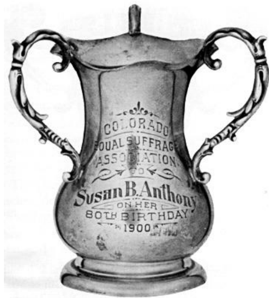
Figure 18.—Cup given to Susan B. Anthony by the Colorado Equal Suffrage Association. Gift of National American Woman Suffrage Association. In Division of Political History. (Acc. 64601, cat. 26163; Smithsonian photo 45992-J.)

The cup, 4\frac{1}{2} inches in diameter and 7\frac{3}{8} inches deep, is marked on the bottom with the Wallace "W," similar to the mark on the tray, and "Sterling, 3798, 4\frac{1}{2} pints, 925/100 fine, Pat 1892."