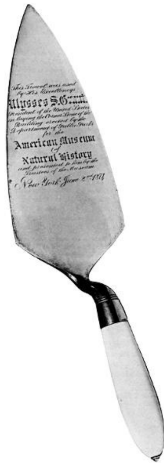
Figure 21.--Trowel used by President Ulysses S. Grant in laying the cornerstone of the Museum of Natural History, New York City. Gift of Julia Dent Grant and William H. Vanderbilt. In Division of Political History. (Acc. 18528, cat. 3004;)

It has an elaborate engine-engraved design and is 21½ inches high.