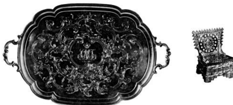
Figure 14.--Tray and saltcellar in shape of chair that were among items presented to Gustavus Vasa Fox on his visit to Russia in 1866. The tray measures 24 \times 15 \times 1\frac{1}{2} inches, and the saltcellar is 3\frac{5}{8} inches high, 4\frac{9}{10} inches long, and 2\frac{3}{4} inches wide. They were made by Sazkoff, St. Petersburg, 1863. Bequest of

American interest in European affairs, considerably increased by the middle of the century, is also reflected in the collection. In 1866 the life of the Czar of Russia was saved from a Nihilist's bullet by the brave action of one of the serfs who had recently been emancipated by royal decree. Czar Alexander II was well liked by his own people and was regarded as an enlightened ruler by the other nations of the West. He was especially respected in the United States because of the open support he gave to the Union side during the Civil War. His escape from death was a cause for official rejoicing in this country, and the Congress of the United States passed a resolution of congratulations on the deliverance of the life of the Czar and commissioned Gustavus Vasa Fox, Assistant Secretary of the Navy, to deliver it to the Czar. Fox set out for Europe in one of the newly designed Monitor ships that had proved so effective in naval fighting during the Civil War. His Monitor was escorted by other ships of the fleet with a large delegation of naval officers. The party was greeted by the Russians with great acclaim, and it was showered with gifts and honors. Many of the interesting items given to Fox personally were bequeathed to the United States National Museum by his widow, Mrs. V. L. W. Fox (accession 50021, Division of Political History). Among these objects are a silver tray (fig. 14), a silver saltcellar in the shape of a chair (fig. 14), and a gold snuffbox.