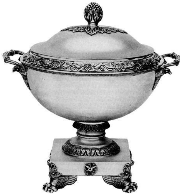
Figure 5.--Tureen presented to Com. John Rodgers by the citizens of Baltimore for his part in the defense of the city against the British in 1814. Bequest of Gen. M. C. Meigs. In Division of Political History. (Acc. 25386, cat. 5863;)

Closely related to this punch set is a covered tureen (fig. 5) that the citizens of Baltimore gave to Commodore John Rodgers, U.S.N., for his part in the defense of Baltimore in September 1814. During the battle of North Point and the attack on Fort McHenry, the naval forces under Commodore Rodgers defended the water battery, the auxiliary forts Covington and Babcock, and the barges of the naval flotilla.