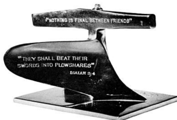
Figure 17.--Paperweight identical to those presented by William Jennings Bryan to 30 diplomats who signed with him treaties for the investigation of all international disputes. Gift of William Jennings Bryan. In Division of Political History. (Acc. 57778, cat. 15307;)