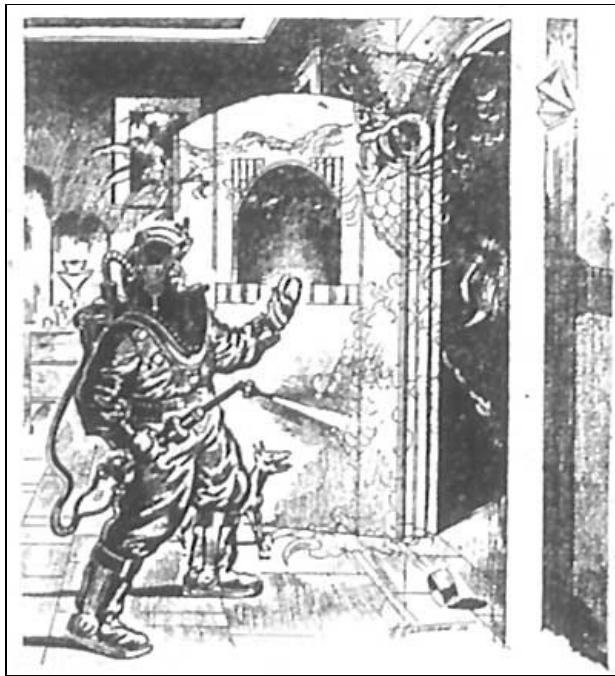
Gigantic claws seemed to reach out of empty air.

T he strangeness of interplanetary space, and the somber mystery of it, pressed upon him like an illimitable and deserted ocean. The sun was a tiny white disk on his right, hanging between rosy coronal wings; his native Earth, a bright greenish point suspended in the dark gulf below it; Mars, nearer, smaller, a little ochre speck above the shrunken sun. Above him, below him, in all directions was vastness, blackness, emptiness. Ebon infinity, sprinkled with far, cold stars.