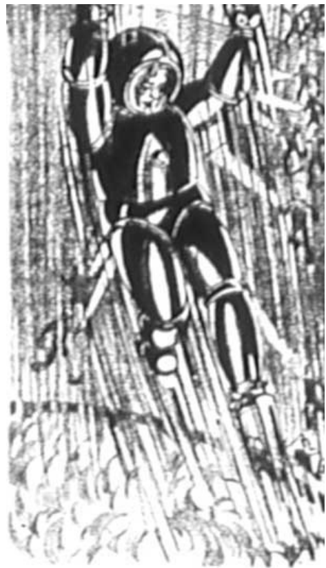
He jumped--directly over the Gorm!

Grant Pemberton sat up suddenly in his berth, every sense straining and alert. What was it that had awakened him in the deathly stillness of the space-flier? His right hand slid under the pillow and clutched the handle of his gun. Its firm coolness was a comforting reality.