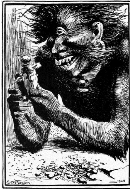
"Sharvan took him up gently between his finger and thumb"--p. 87.

The poor fairy lay as if he were dead, and then the giant, feeling sorry for what he had done, took him up gently between his finger and thumb.