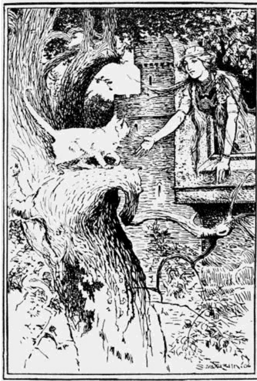
“Poor little pussy,” said the Princess”—p. 42.

The princess stepped back, and the little white cat jumped into the room. The princess took the little cat on her lap and stroked him with her hand, and the cat raised up its back and began to purr.