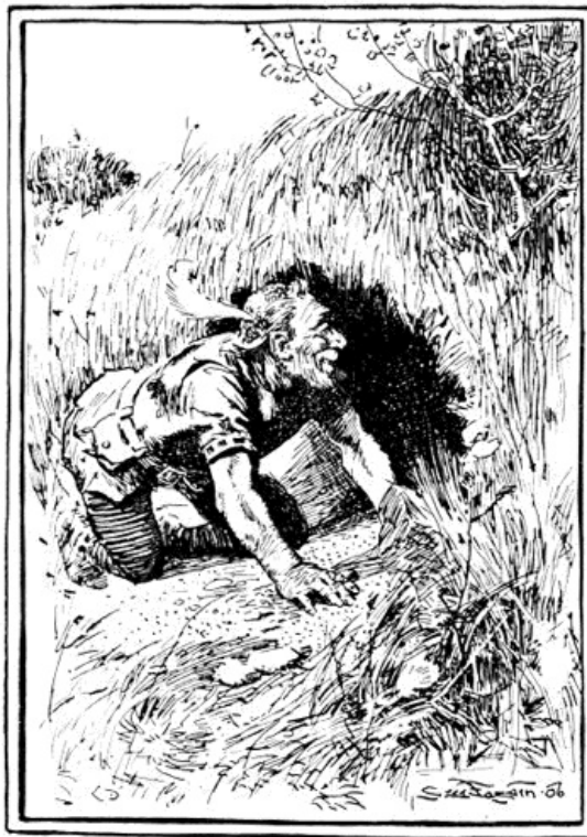
"The dwarf followed the little man through a hole in the side of a green hill"--p. 3.

The dwarf got off his horse and followed the little man through a hole in the side of a green hill. The hole was so small that he had to go on his hands and knees to pass through it, and when he was able to stand he was only the same height as the little fairyman. After walking three or four steps they were in a splendid room, as bright as day. Diamonds sparkled in the roof as stars sparkle in the sky when the night is without a cloud. The roof rested on golden pillars, and between the pillars were silver lamps, but their light was dimmed by that of the diamonds. In the middle of the room was a table, on which were two golden plates and two silver knives and forks, and a brass bell as big as a hazelnut, and beside the table were two little chairs covered with blue silk and satin.