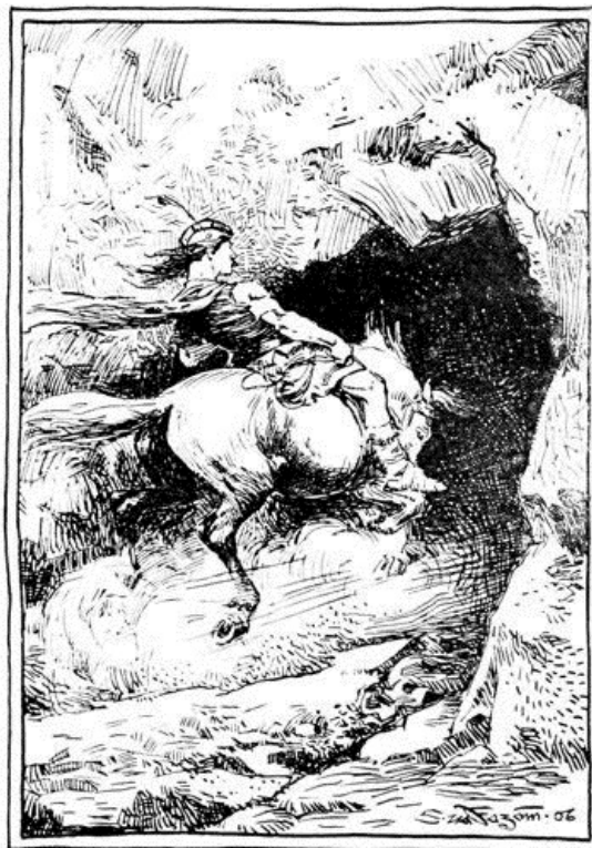
“The Prince endeavoured to rein in his steed, but the impetuous animal bore him on”--p. 102

“You are welcome, Cuglas,” said the herald, “and I have been sent by the Princess Crede to greet you and to lead you to her court, where you have been so long expected.”