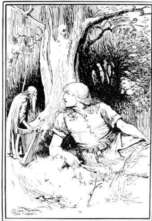
"He started up, and who should he see but a little wizened old man"--p. 136.

At last, over the Fenian camp, and over the great plain and the multitude that thronged it, sleep fell, clothing them with a silence as deep as that which dwelt in the forest, where, dreaming of the princess, Fergus lay. He awoke at the first notes of the birds, but though he felt he ought to go back to his companions and be witness of the contest which might determine whether the princess was to be another's bride, his great love and his utter despair of winning her so oppressed him that he lay as motionless as a broken reed. He scarcely heard the music of the birds, and paid no heed to the murmur of the brook rushing by his feet. The crackling of branches near him barely disturbed him, but when a shadow fell across his eyes he looked up gloomily, and saw, or thought he saw, someone standing before him. He started up, and who should he see but the little wizened old man who found shelter in his father's hut on the stormy night.