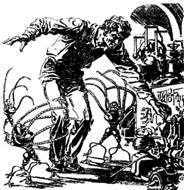
He somehow managed to close the tiny switch.

*** START OF THE PROJECT GUTENBERG EBOOK RAIDERS OF THE UNIVERSES ***