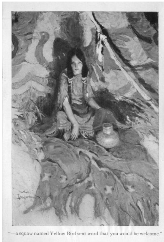
"—a squaw named Yellow Bird sent word that you would be welcome."

"—a squaw named Yellow Bird send word that you would be welcome."