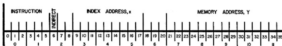
INSTRUCTION FORMAT FIGURE 2