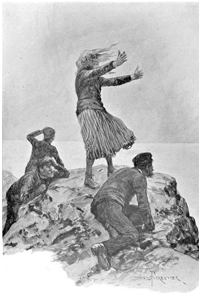
A picturesque old figure standing there.

"Ah! you hungry, you thirst, messieurs; sailor-man always like that. Your ship gone? Never mind, he shall come back again, to-day, to-morrow, one, two, three day—pray God it be not longer, shipmate, pray God!"