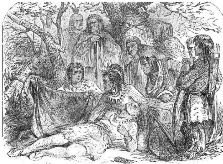
THE DEATH OF ALEXANDER.

The tragic death of Alexander introduced to the throne his brother Pometacon, whom the English named King Philip.