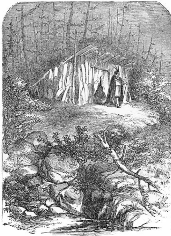
THE PALACE OF MASSASOIT.

During the whole of the day, after crossing the river, they met with but two Indians on their route, so effectually had the plague swept off the inhabitants. But the evidence was abundant that the region had formerly been quite populous with a people very poor and uncultivated. Their living had been manifestly nothing but fish and corn pounded into coarse meal. Game must have been so scarce in the woods, and with such difficulty taken with bows and arrows, that they could very seldom have been regaled with meat. A more wretched and monotonous existence than theirs can hardly be conceived. Entirely devoid of mental culture, there was no range for thought. Their huts were miserable abodes, barely endurable in pleasant weather, but comfortless in the extreme when the wind filled them with smoke, or the rain dripped through the branches. Men, women, children, and dogs slept together at night in the one littered room, devoured by fleas. The native Indian was a degraded, joyless savage, occasionally developing kind feelings and noble instincts, but generally vicious, treacherous, and cruel.