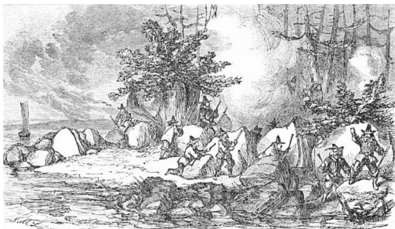
THE BATTLE IN TIVERTON.

Captain Church then went, with a small army, to ravage the territories of Wetamoo. When he arrived at the spot where Fall River now stands, he found that Wetamoo, with her warriors, had taken refuge in a neighboring swamp. Just then news came that a great part of the town of Dartmouth was in flames, that many of the inhabitants were killed, and that the survivors were in great distress. Captain Church marched immediately to their rescue. But the foe had finished his work of destruction, and had fled into the wilderness, to emerge at some other spot, no one could tell where, and strike another deadly blow. The colonists, however, took one hundred and sixty Indians prisoners, who had been induced by promises of kind treatment to come in and surrender themselves. To the extreme indignation of Captain Church, all these people, in most dishonorable disregard of the pledges of the capitulation, were by the Plymouth authorities sold into slavery. This act was as impolitic as it was criminal. It can not be too sternly denounced. It effectually deterred others from confiding in the English.