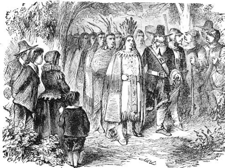
MASSASOIT AND HIS WARRIORS.