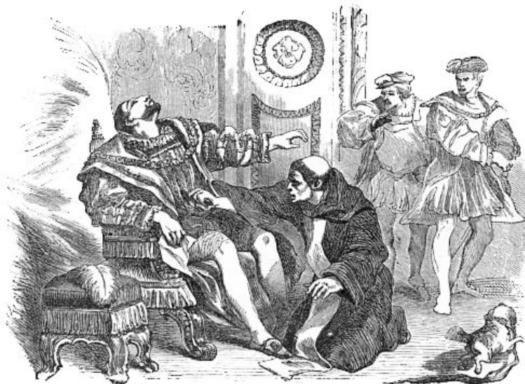
THE ASSASSINATION OF HENRY III.