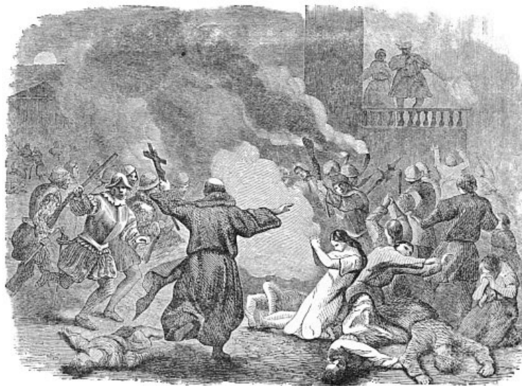
THE MASSACRE OF ST. BARTHOLOMEW.

Just before the carnage commenced, Marguerite, weary with excitement and the agitating conversation to which she had so long been listening, retired to her private apartment for sleep. She had hardly closed her eyes when the fearful outcries of the pursuers and the pursued filled the palace. She sprang up in her bed, and heard some one struggling at the door, and shrieking "Navarre! Navarre!" In a paroxysm of terror, she ordered an attendant to open the door. One of her husband's retinue instantly rushed in, covered with wounds and blood, pursued by four soldiers of her brother's guard. The captain of the guard entered at the same moment, and, at the earnest entreaty of the princess, spared her the anguish of seeing the friend of her husband murdered before her eyes.