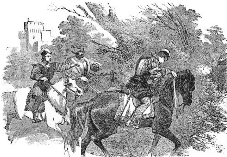
THE ASSASSINATION OF FRANCIS, DUKE OF GUISE.

He immediately fell upon his horse's neck, and was caught in the arms of his friends. They conveyed him to the castle, where the duchess received him with cries of anguish. He embraced her tenderly, minutely described the circumstances of his assassination, and expressed himself grieved in view of the stain which such a crime would inflict upon the honor of France. He exhorted his wife to bow in submission to the will of Heaven, and kissing his son Henry, the Duke of Joinville, who was weeping by his side, gently said to him,