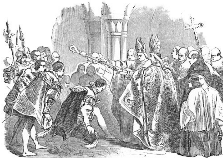
THE ACT OF ABJURING PROTESTANTISM.

The Archbishop of Bourges was seated at the entrance of the church in a chair draped with white damask. The Cardinal of Bourbon, and several bishops glittering in pontifical robes, composed his brilliant retinue. The monks of St. Denis were also in attendance, clad in their sombre attire, bearing the cross, the Gospels, and the holy water. Thus the train of the exalted dignitary of the Church even eclipsed in splendor the suite of the king.