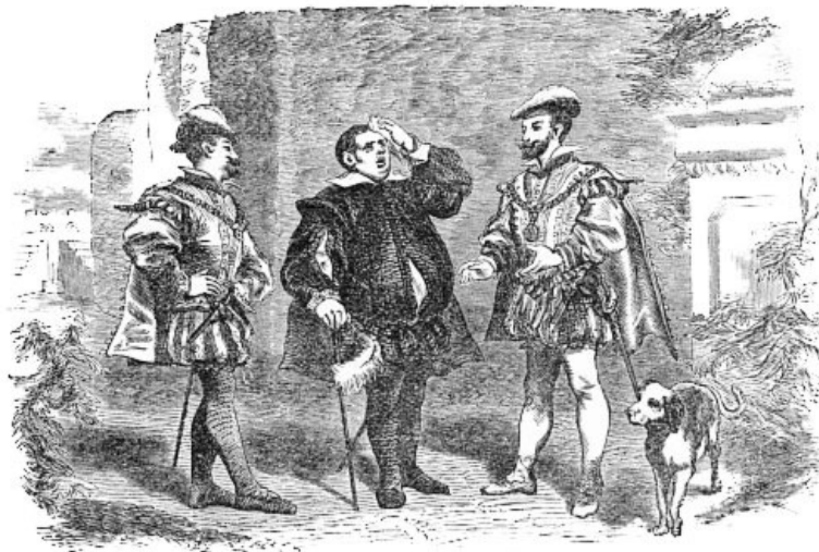
THE RECONCILIATION WITH MAYENNE.

There were still parts of the kingdom which held out against Henry, and Spain and Flanders freely supplied men and ammunition to the fragments of the League. Calais was in the hands of the enemy. Queen Elizabeth of England had ceased to take much interest in the conflict since the king had gone over to the Catholics. When Calais was besieged by the foe, before its surrender she offered to send her fleet for its protection if Henry would give the city to her. Henry tartly replied, "I had rather be plundered by my enemies than by my friends."