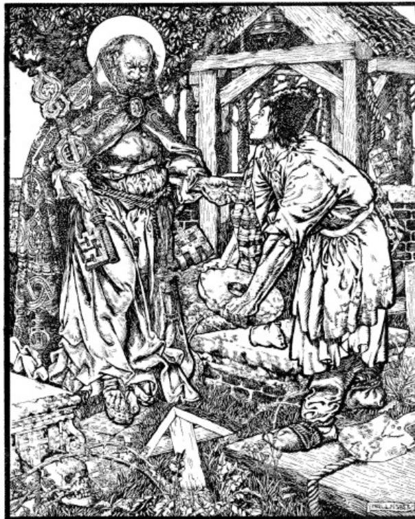
SUDDENLY ST PETER APPEARED TO HIM