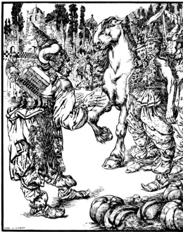
"HOW MUCH DO YOU WANT FOR THAT HORSE?"