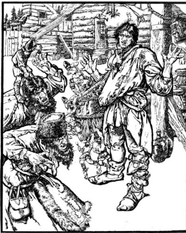
"OUT OF THE DRUM, MY HENCHMEN!"