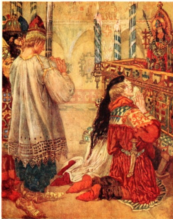
THEY WERE BOTH ON THEIR KNEES

And at dawn of day crowds of people, with the Tsar at the head of them, came to the church. "Shall we find him reading prayers, or shall we only find his bones?" said they. And lo! there they both were on their knees praying fervently to God. Then the Tsar rejoiced greatly, and embraced both him and her. After that they had a grand service in the church, and sprinkled her with holy water, and baptized her again, and the unclean spirit departed from her. Then the Tsar gave the young man half his power and half his kingdom, but the merchants departed in their ships, with their nephew on board.