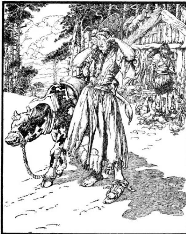
THE GIRL DROVE THE HEIFER OUT TO GRAZE

And the next day she called the old man's daughter again, "Get up, thou daughter of a dog, and take the heifer out to graze. And here thou hast a bundle of raw flax; unravel it, heckle it, wind it on to thy spindles, bleach it, weave with it, and make it into fine cloth for me by the evening!"--Then the girl drove out the heifer to graze. The heifer began grazing, but she sat down beneath a willow-tree, and threw her flax down beside her, and began weeping with all her might. But the heifer came up to her and said, "Tell me, little maiden, wherefore dost thou weep?"--"Why should I not weep?" said she, and she told the heifer all about it.--"Grieve not!" said the heifer, "it will all come right, but lie down to sleep."--So she lay down and immediately fell asleep. And by evening the bundle of raw flax was heckled and spun and reeled, and the cloth was woven and bleached, so that one could have made shirts of it straight off. Then she drove the heifer home, and gave the cloth to her stepmother.