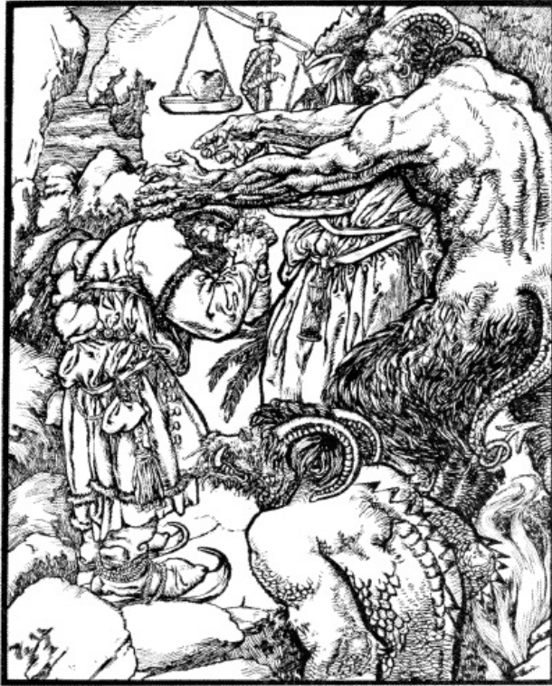
THE RULERS OF HELL LAID HANDS UPON THE OVERSEER STRAIGHTWAY

out for thee for some time!" So Ivan returned without the overseer, and the nobleman said to him, "Where's my overseer?"--"I left him in hell," said Ivan, "and they said there that they were waiting for you, sir, too." When the nobleman heard this he hanged himself, but Ivan lived happily with his wife.