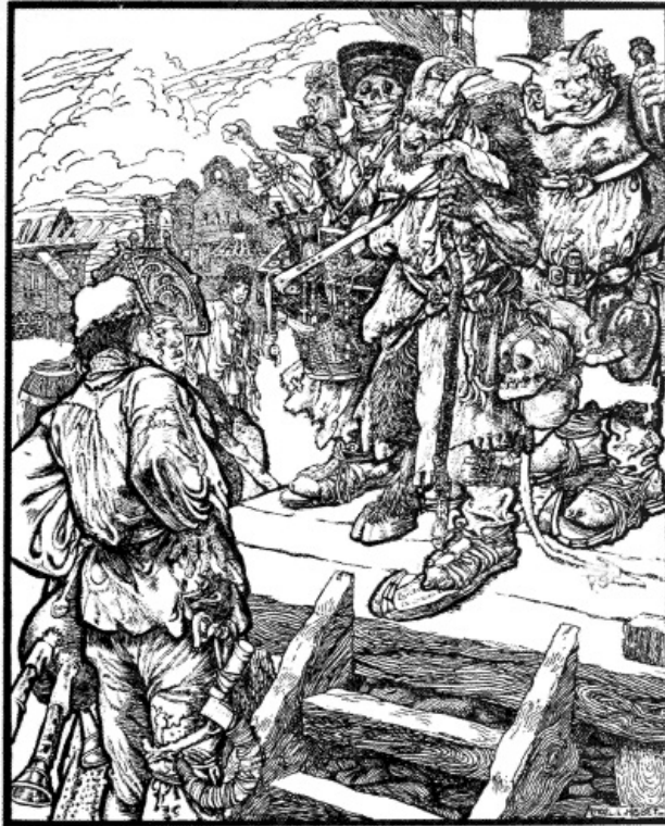
ALL MANNER OF EVIL POWERS WALKED ABROAD

THE olden times were not like the times we live in. In the olden times all manner of Evil Powers[1] walked abroad. The world itself was not then as it is now: now there are no such Evil Powers among us. I'll tell you a kazka [2] of Oh, the Tsar of the Forest, that you may know what manner of being he was.