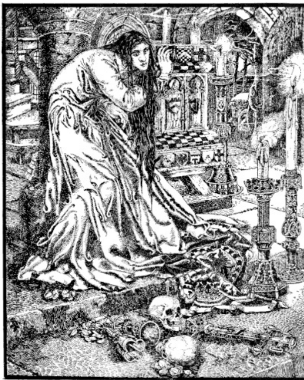
THE TSARIVNA AROSE FROM HER COFFIN

When God's bright day dawned, the people came to clean out the church and sweep away his bones; but there he was reading his prayers, and the rumour of it went through the town and they were all filled with joy.