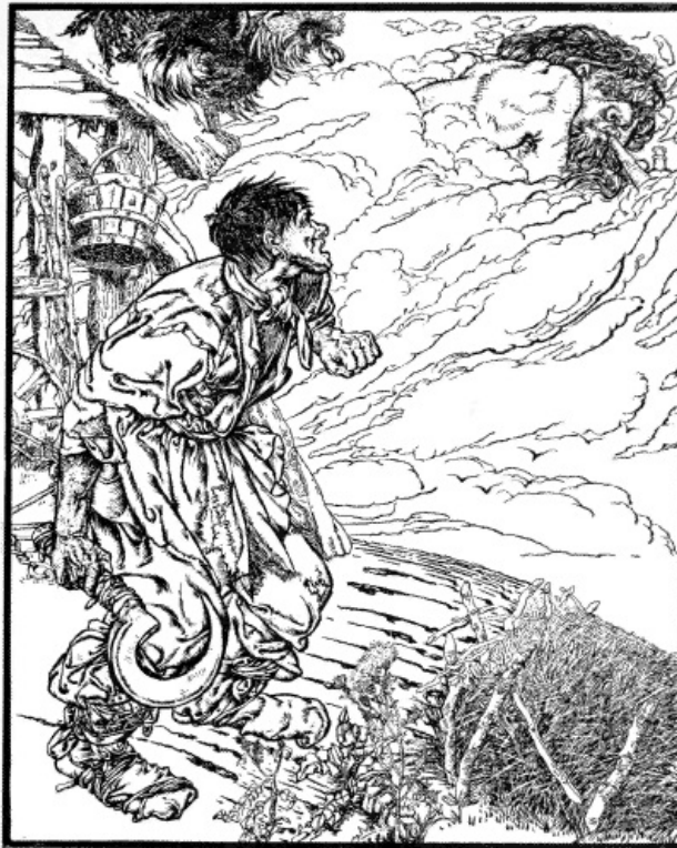
THE WIND CAME AND SWEEPED ALL HIS CORN AWAY

One day, at harvest-time, the poor man left his wife and went to reap and thresh out his little plot of wheat, but the Wind came and swept all his corn away down to the very last grain. The poor man was exceeding wrath thereat, and said, "Come what will, I'll go seek the Wind, and I'll tell him with what pains and trouble I had got my corn to grow and ripen, and then he, forsooth! must needs come and blow it all away."