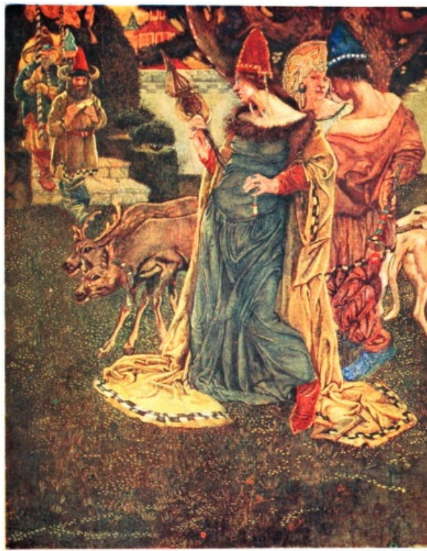
THE TSAR'S COUNCILLORS WENT TO THE HOUSES OF ALL THE NOBLES AND PRINCES