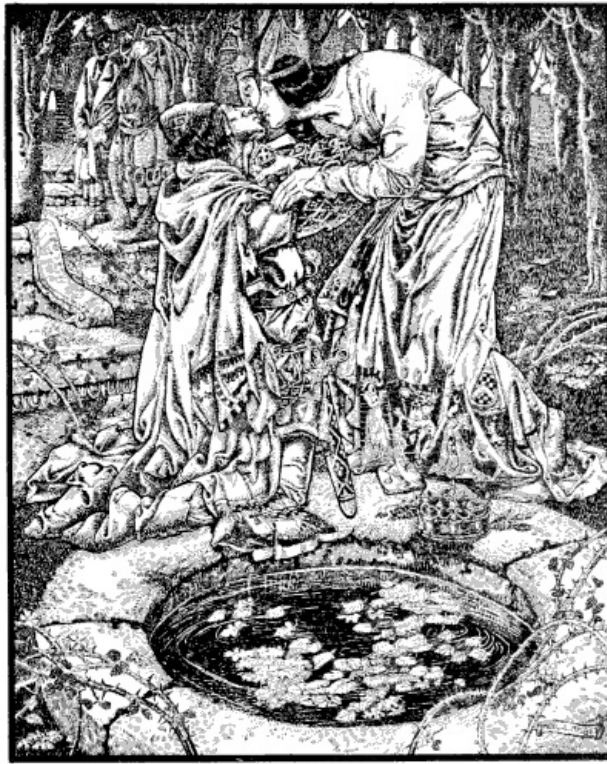
HIS WIFE CARESSED AND WHEEDED HIM