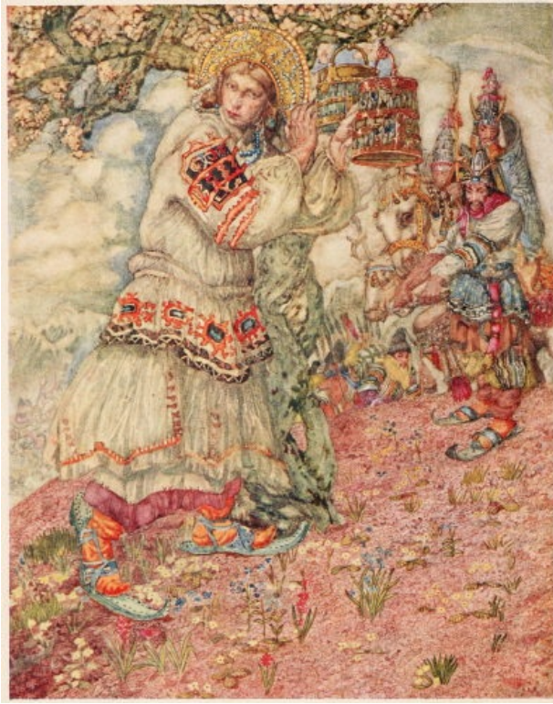
THEY CAME TO THE PLACE WHERE HE HAD LEFT HER PAGE 79