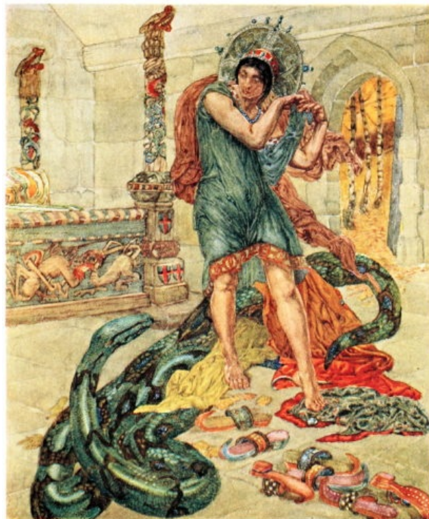
NINETEEN TIMES DID SHE CAST OFF ONE OF HER SUITS OF CLOTHES

The old Tsar sent for him again and again, but his son would never go. At last the wife was ashamed, and said to her husband one day, "Dear heart! let me go to thy father! I will only go for my own pastime, lest he get angry. Why should I not go?" Then he let her go, and she went to the court of the old Tsar, and took her pastime there. She amused herself finely, and ate and drank her fill of all good things. Now her husband had laid this command upon her, "Go and divert thyself if thou wilt, but if thou tell my father and my mother what has happened to me, and how I have lost my twenty serpent skins, thou shalt never see me more." For they did not know that he was now no longer a serpent, but a simple Tsarevich. She vowed she would never tell; but for all her promises, she nevertheless told them at last how her husband had lost his