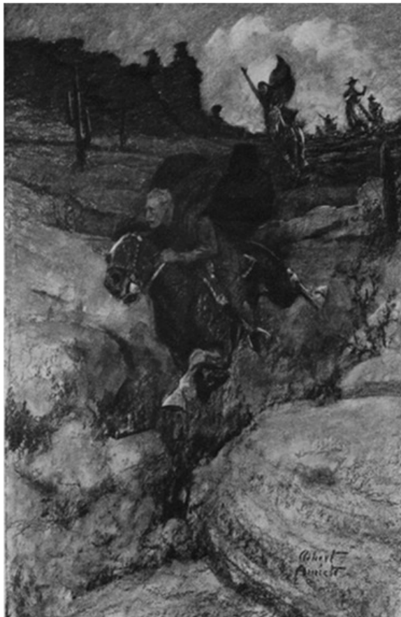
The Indian girl was steadily gaining on the German.

A flash of lightning outlined the three ahead, and a wail of utter terror went up from them all.