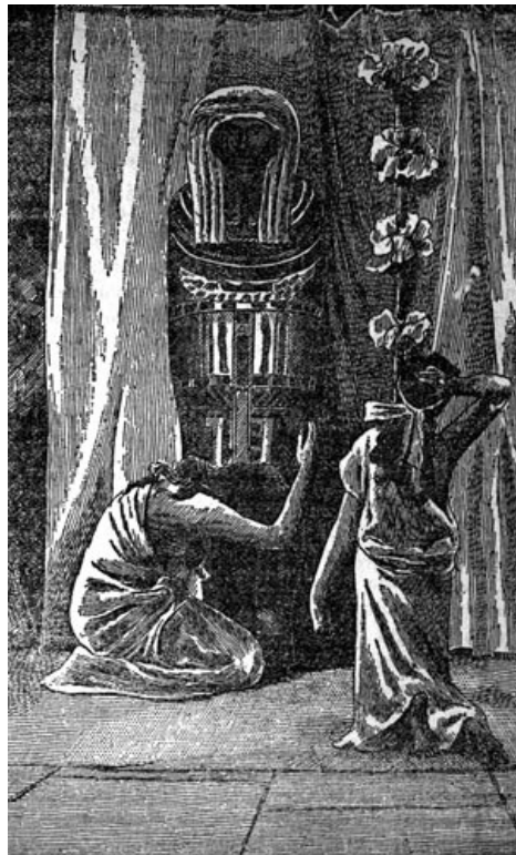
C. of B. AMENSE AND MYSA BEWAIL THE DEATH OF NECO.—Page 175.

The magistrates, who arrived soon after Ameres to investigate the matter, called the whole of those who could be suspected of harboring ill-will against Neco to be brought before them and questioned as to their doings during the night. All stoutly asserted that they had been in bed at the time of the murder, and nothing occurred to throw a suspicion upon one more than another. As soon as the investigation was concluded Ameres ordered the corpse to be brought to his own house.