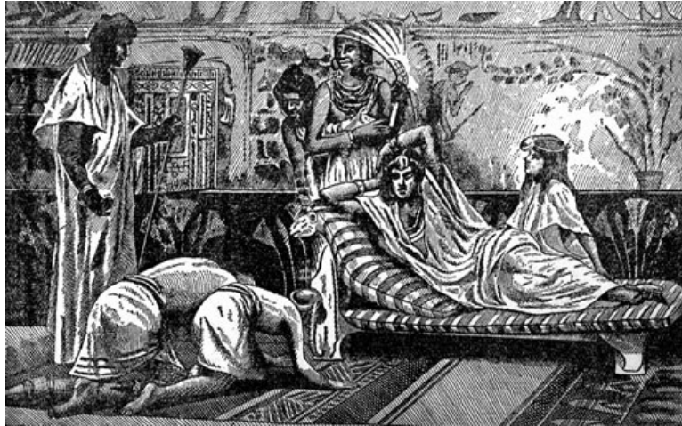
C. of B. THE HIGH-PRIEST PRESENTS AMUBA AND JETHRO TO HIS WIFE.— Page 68.

"Oh, mamma, I think it so pretty," Mysa exclaimed. "I do wish my hair was gold-colored like that boy's, instead of being black like everyone else's."