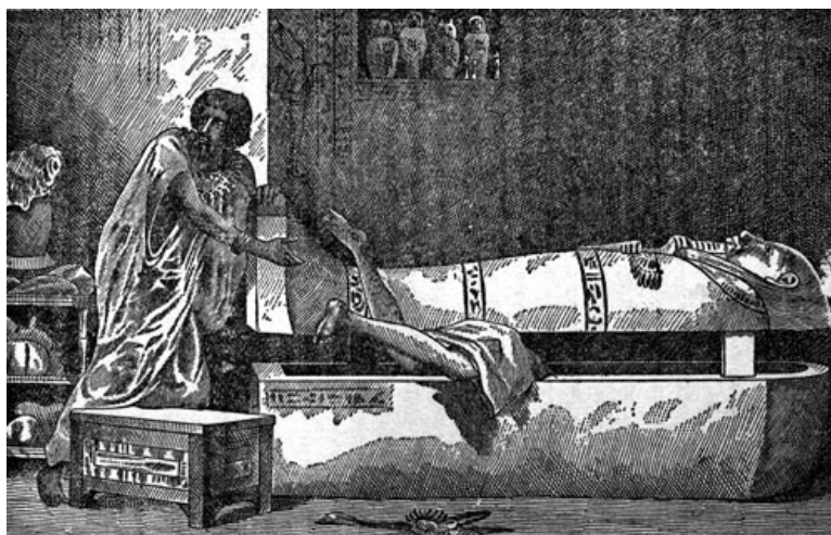
C. of B. THE HIDING-PLACE OF CHEBRON AND HIS FRIENDS.— Page 252.

"Here you will be perfectly safe," Chigrion said. "You can keep the stone rolled back unless you see any one approaching; and you would be sure to make out any considerable number of searchers mounting the hillside long before they reach you. Should you see them, you will of course close the door, enter each of you one of the sarcophagi, lie down in the inner case, close the lid of the sarcophagus, and place the lid of the inner case over you. I think it unlikely in the extreme that any search will be made for you, or at any rate a search only of untenanted tombs. The fact of the stone here being left uncemented is a mere accident probably known only to myself and its owner. It is only as an extreme resource that you could need to take to these hiding-places. As far as passers-by are concerned you might remain outside altogether, but in that case you would run some risk of being noticed. You may be sure that the hills will be closely scanned, and if figures were seen moving about here a party might set out to see whether these were the fugitives so eagerly sought for. Therefore I say, during the daytime keep yourselves concealed here. As soon as it is dark you can of course issue out and pass the night wherever you may think fit."