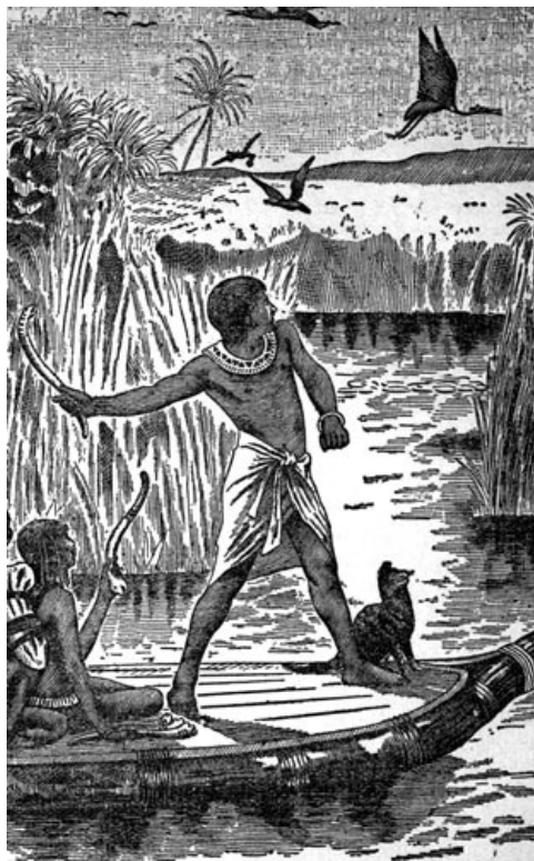
C. of B. FOWLING WITH THE THROWING-STICK.— Page 111.

Instantly, with wild cries of alarm, the whole flock arose, but before they had fairly settled in their flight, two more fell pierced with arrows. The cats had been standing on the alert, and as the cry of alarm was given leaped overboard from the stern, and proceeded to pick up the dead ducks, among which were included that which had at first flown away, for it had dropped in the water about fifty yards from the boat. A dozen times the same scene was repeated until some three score ducks and geese lay in the bottom of the boat. By this time the party had had enough of sport, and had indeed lost the greater part of their arrows, as all which failed to strike the bird aimed at went far down into the deep mud at the bottom and could not be recovered.