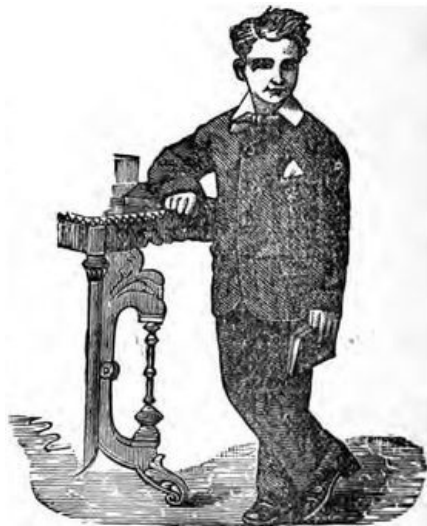
THE SAME PUPIL AFTER ONE YEAR'S TRAINING.

A The Mayor, addressing the Head Master of the Institution, said something must be done with the