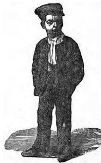
PUPIL AS TAKEN FROM THE POLICE COURT.

boy; unfortunately he was getting worse and worse; the case was a very sad one, the boy being deaf and dumb, but the public must be protected. The other magistrates present concurred with the Mayor's remarks, and after consulting with