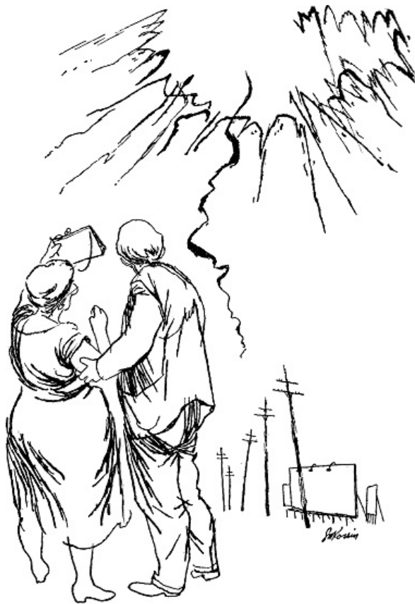
Illustrator: Sanford Kossin

*** START OF THE PROJECT GUTENBERG EBOOK THE BIG TOMORROW ***