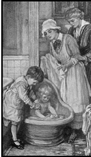
He washed his small sister with thoroughness and despatch, pointing out ... that he "went into all the corners."

So it ended in Tony's being arrayed in the flannel apron which, tied under his arm-pits, was not so greatly too long. With his sleeves turned up he washed his small sister with thoroughness and despatch, pointing out somewhat proudly that he "went into all the corners." [157]