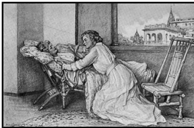
"It would make it easier for both of us if you'd face it, my dear."

"Don't you want to be there?" Jan asked, hoarsely.