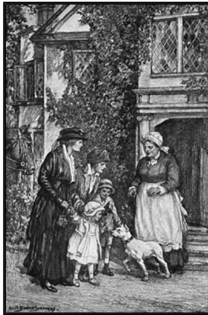
William rushed out to welcome the strangers. Two ... nice children.

He wished to ingratiate himself, and proceeded to show off his one accomplishment. With infinite difficulty and patience the Miss Walcotes had taught him to "give a paw"; so now, on this first evening, William followed the children about solemnly offering one paw and then the other; a performance which was greeted with acclamation.